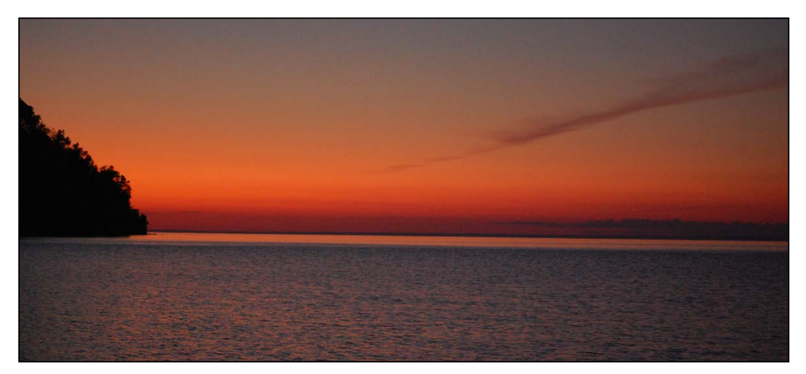
8. Lake Superior sunset from s/y BALLO LISCIO anchored near Oak Island in the Apostle Islands, Wisconsin.