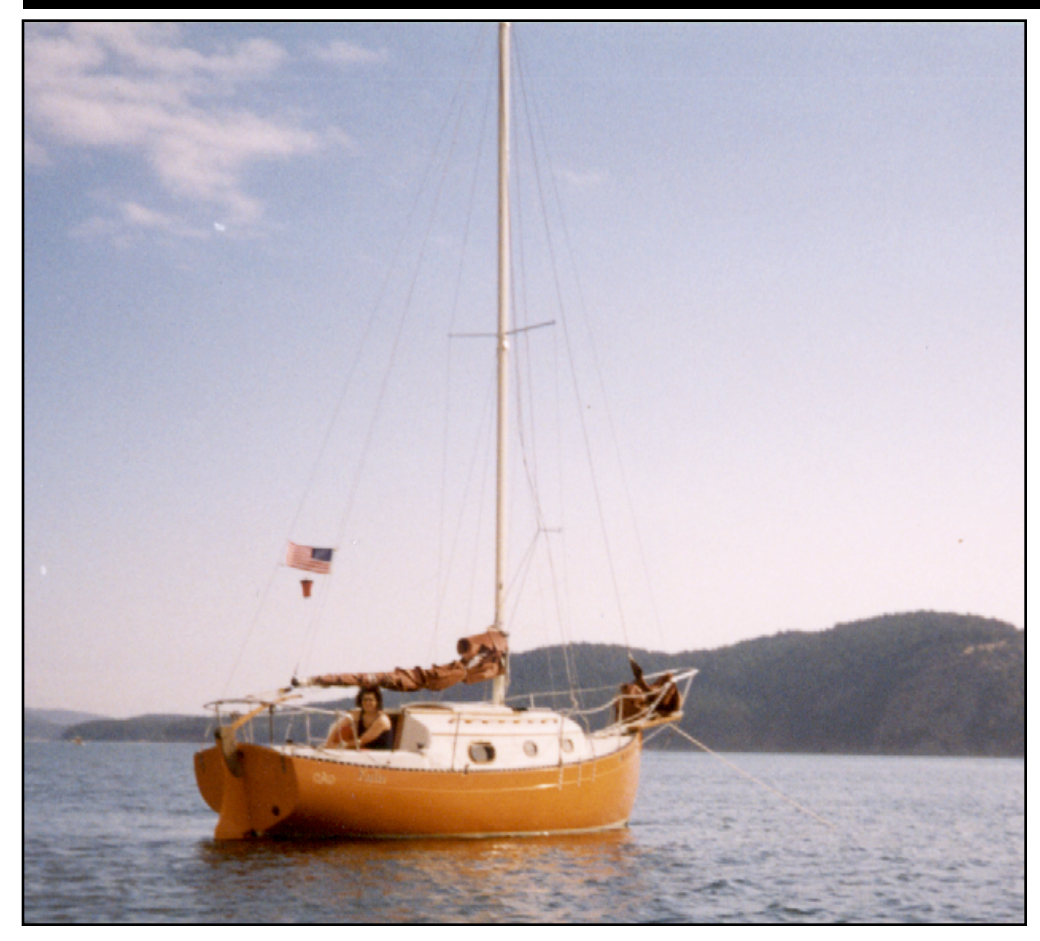
3. KALIA (#250) at Sucia Island Marine Park, San Juan Islands, Washington State.