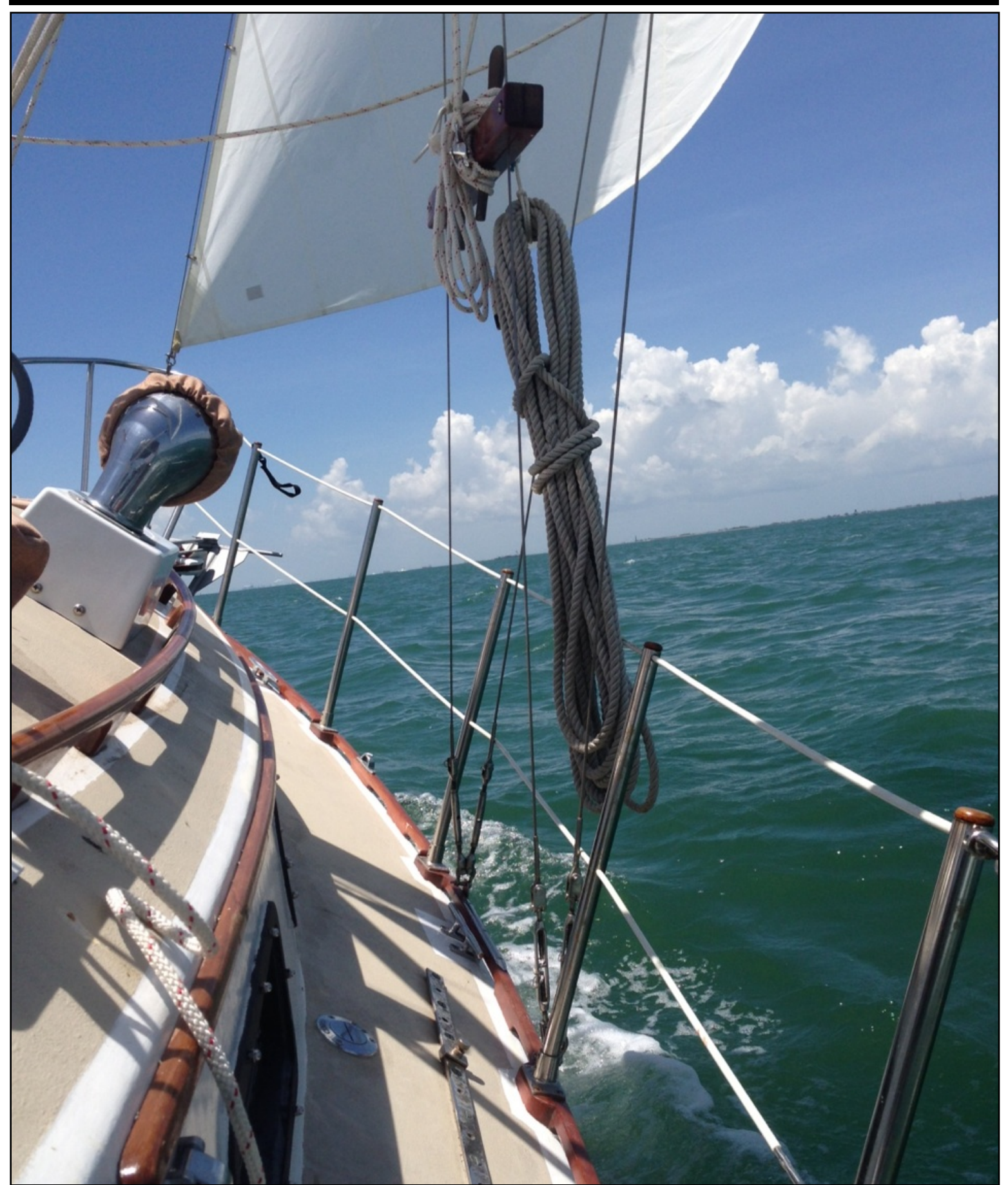
15. The first trip into the Gulf of Mexico for s/y ENTERPRISE near Galveston Bay with Hal DeVaney. Congratulations!