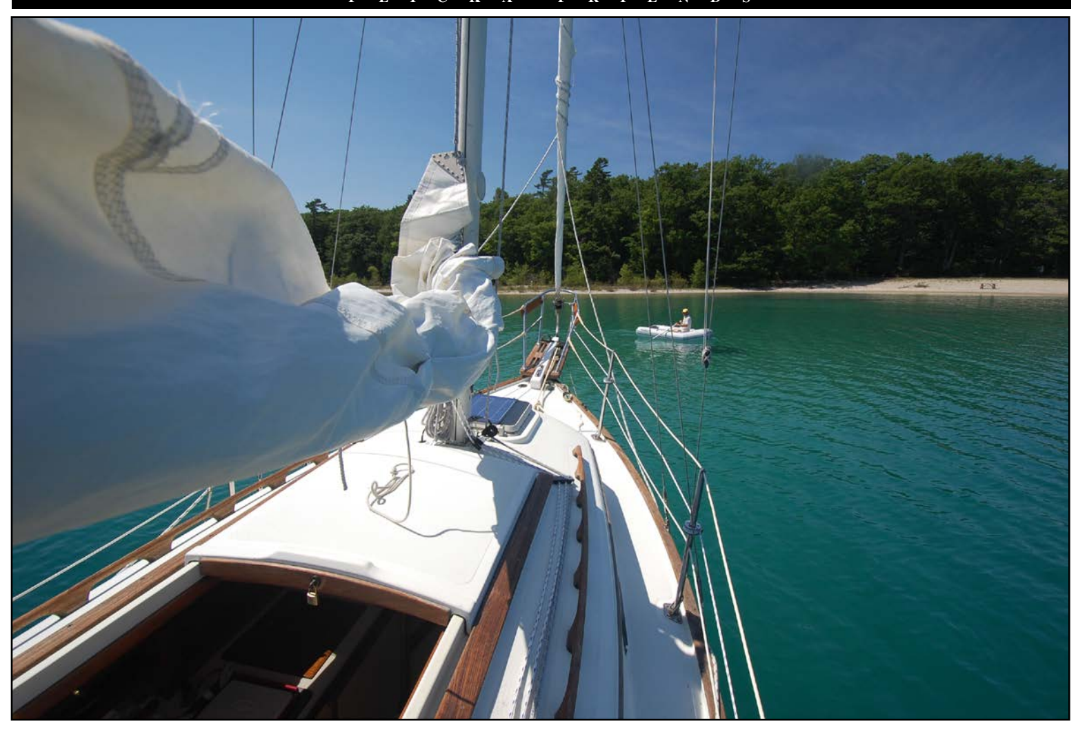
13. Rowing a shore from s/y ZANZIBAR at Power Island, West Bay, Grand Traverse Bay, Lake Michigan.