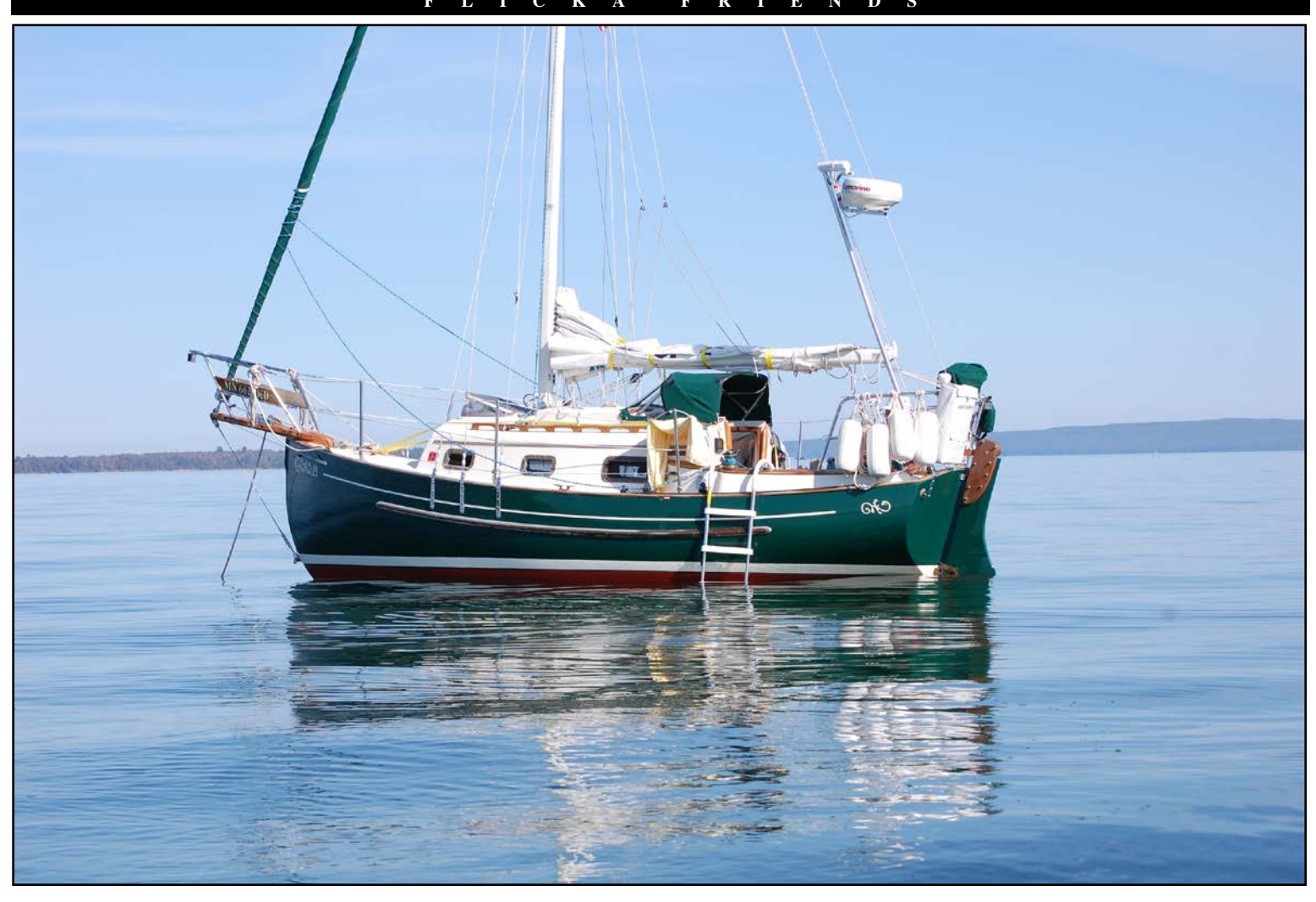
7. BALLO LISCIO anchored in Justice Bay, Sand Island, Apostle Islands, Wisconsin.