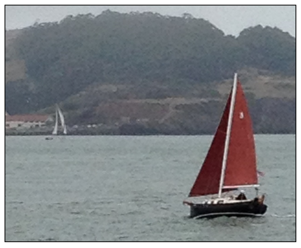
4. My Flicka sailing out towards the Gate in SF Bay. No name yet, too busy sailing!