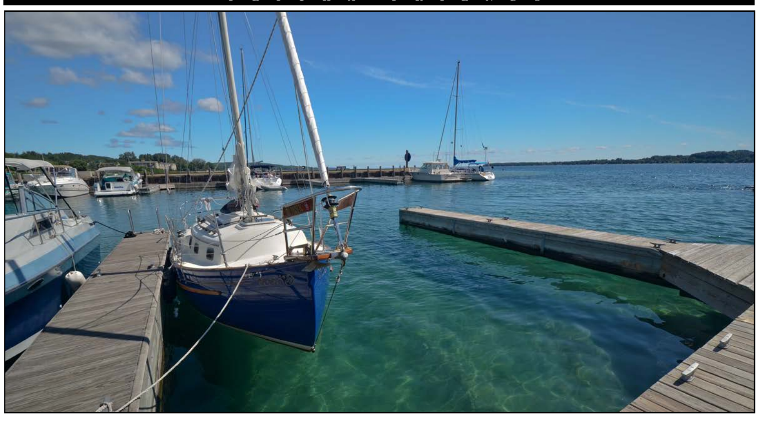
11. ZANZIBAR at the transient boat dock in Suttons Bay, Michigan.