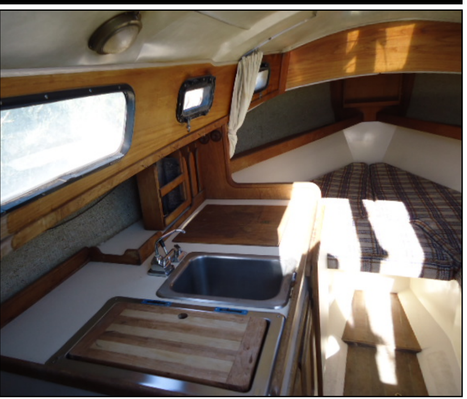
20/21. A veteran of Hawaii and the Sea of Cortez, s/y WINDSHIFT II currently sails on Lake Tahoe.