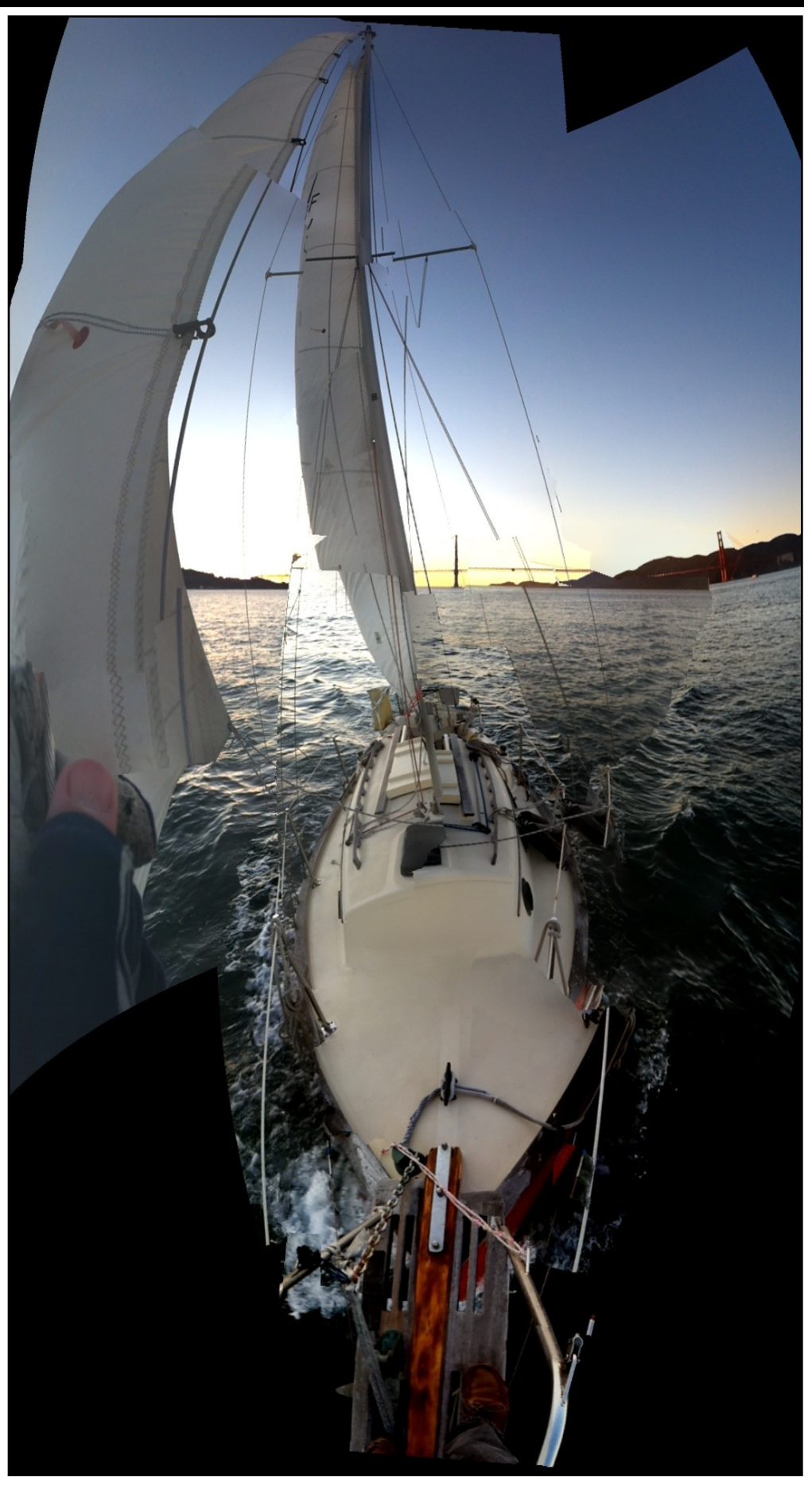
2. Collage image of s/y WHISPER and the Golden Gate Bridge.