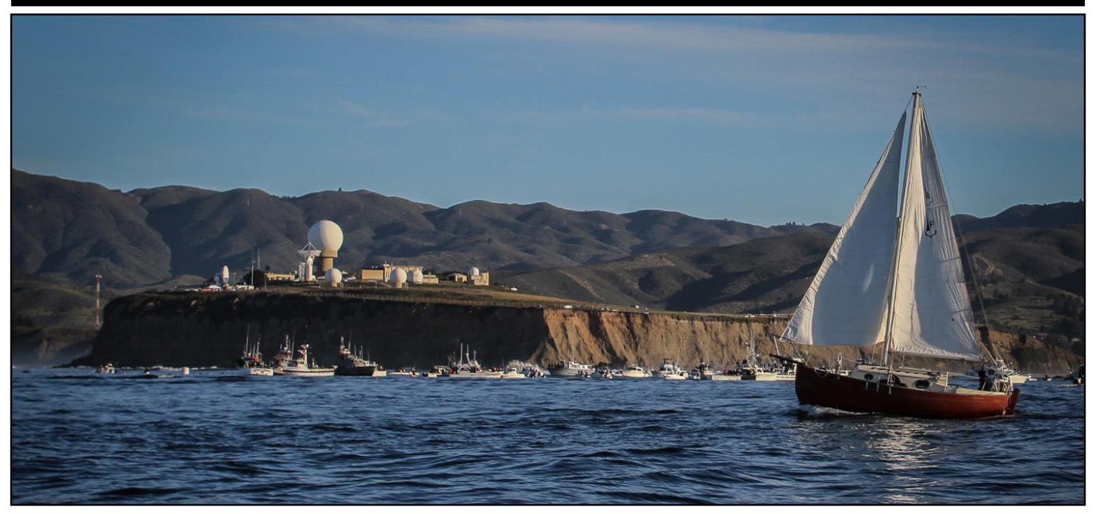
5. Going by the Maverick Big Wave Surf Competition on the way to the S.F. Bay from Half Moon Bay aboard s/y WHISPER .