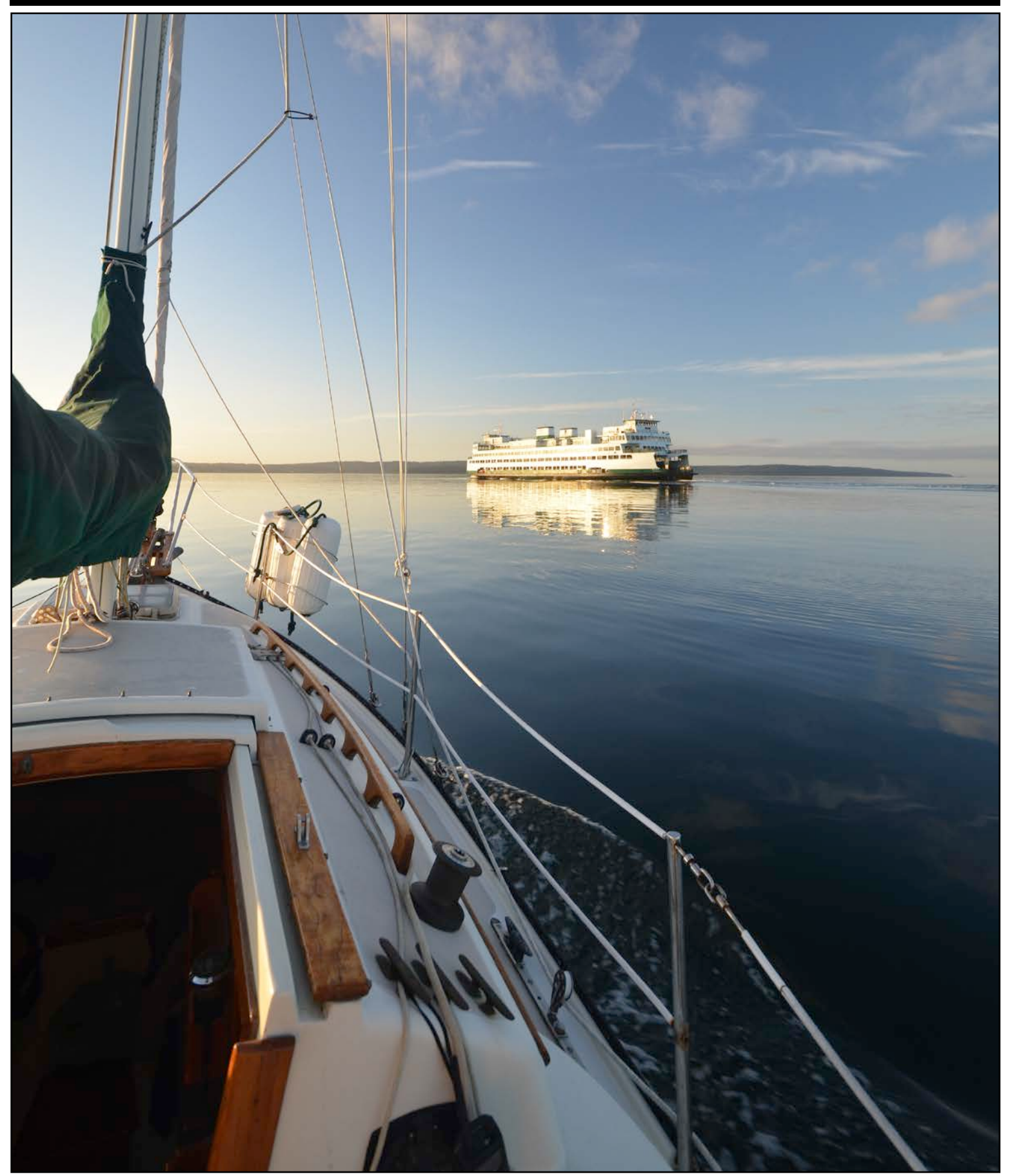
10. A Washington State Ferry in the passing lane in the San Juan Channel at six in the morning. I'm motoring in dead clam conditions aboard s/y BLUE SKIES to enter Fisherman Bay's narrow channel at high slack tide or very close to it.