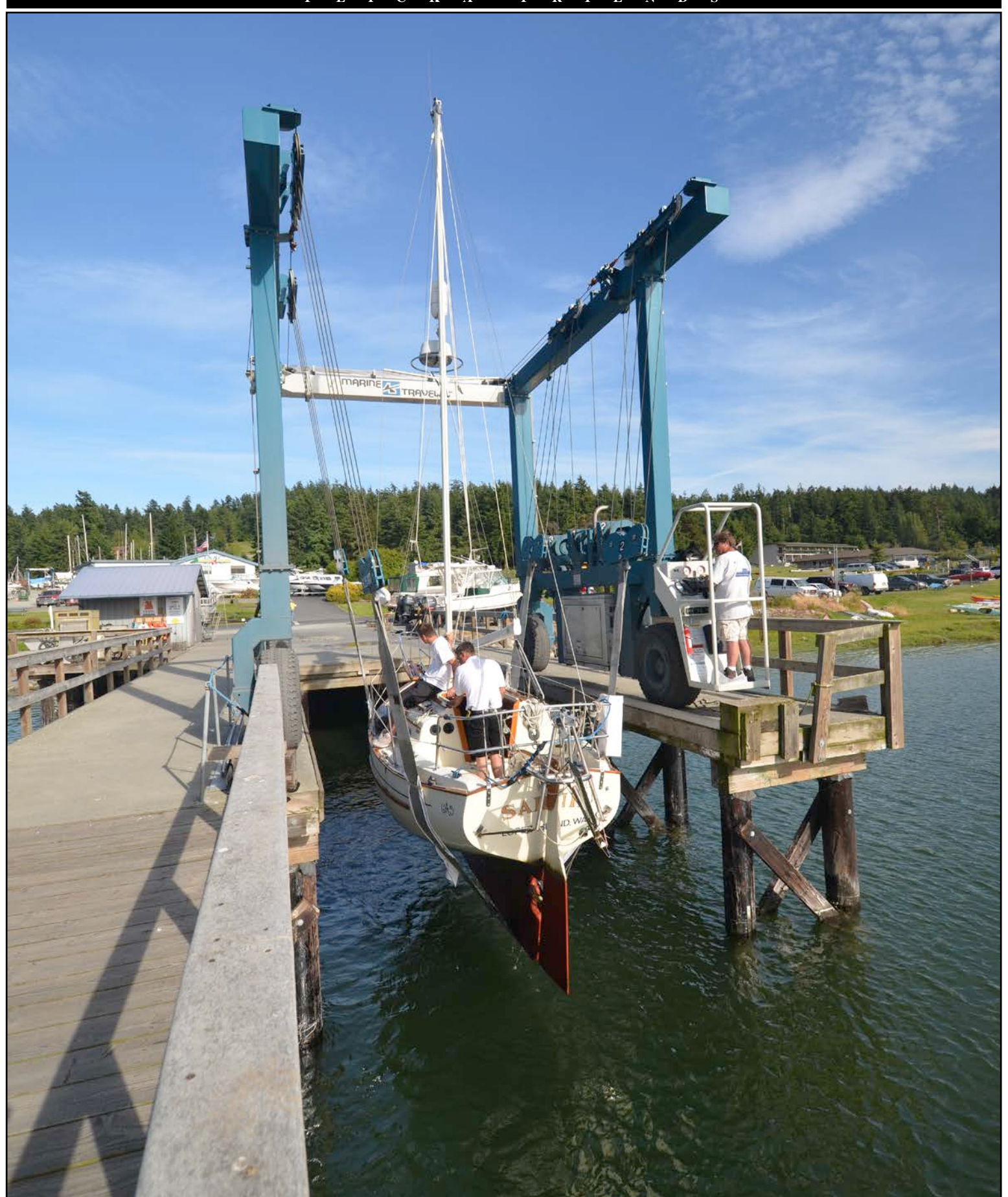
24. The marina crew lifting s/y SARNIA from Fisherman's Bay on Lopez Island.