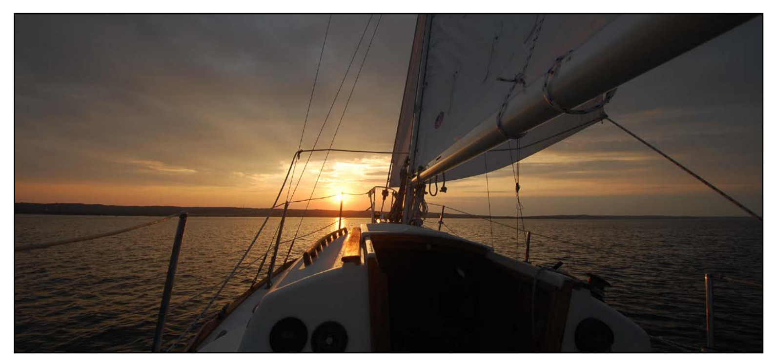
14. Sunset sailing on West Bay aboard s/y ZANZIBAR .