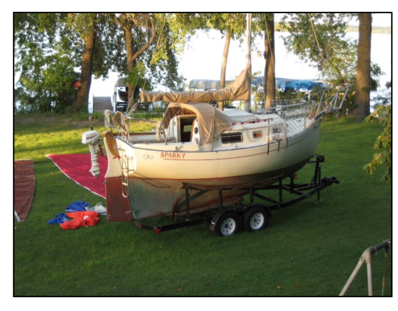
19. Starboard side of s/y SPARKY . Photo: Jim McMillan © 2013