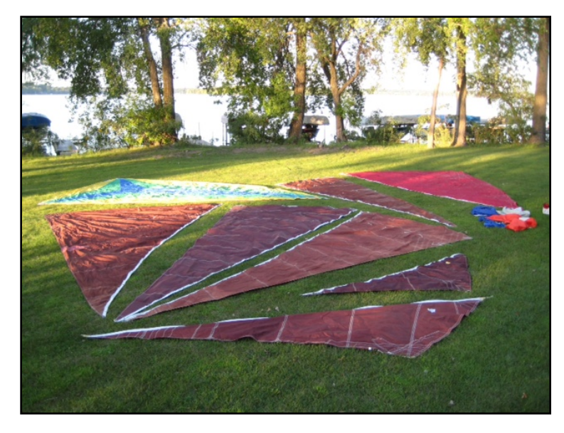
18. SPARKY has a great sail inventory.