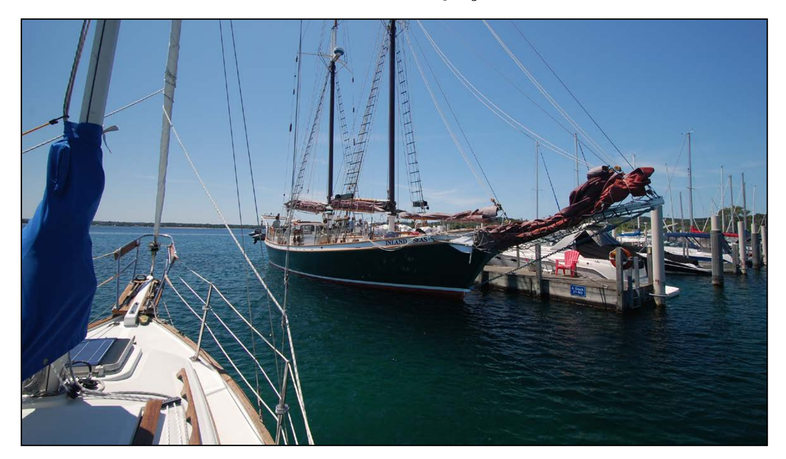
12. Passing the s/v INLAND SEAS on the way out of the marina aboard s/y ZANZIBAR . Nikkor 10-24 mm lens @ 10mm.