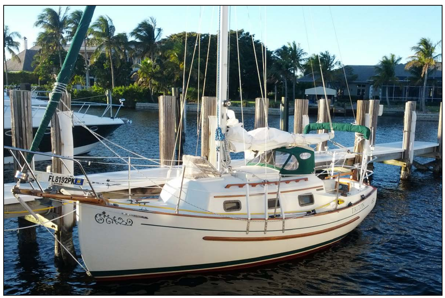
6. Here is s/y TRITON, my PSC Flicka (#429), at the St. Charles Yacht Club in Fort Myers, Florida after a day on the Gulf of Mexico. Even though she's the smallest (by far) yacht at the club, members still come by to comment that she's adorable...