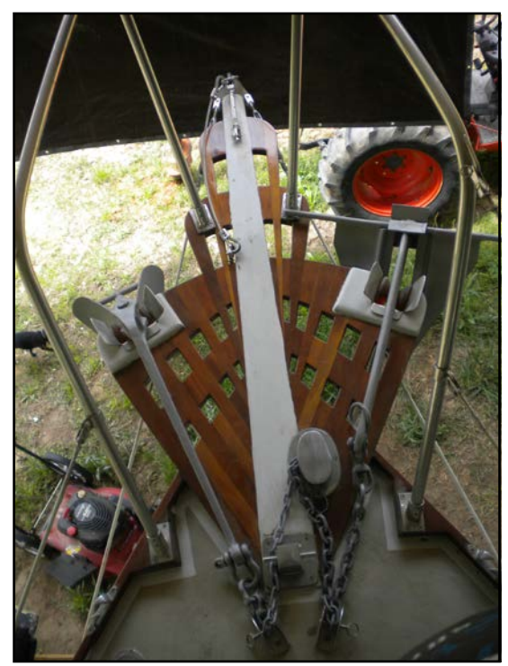
14. Anchors on the unique bowsprit.