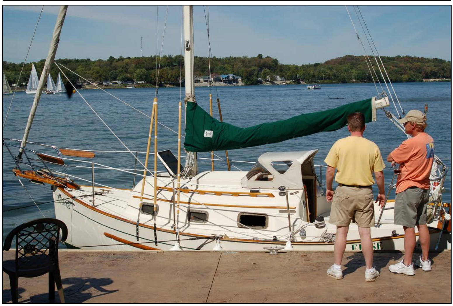
4. Admiring my Flicka: s/y ELISE .