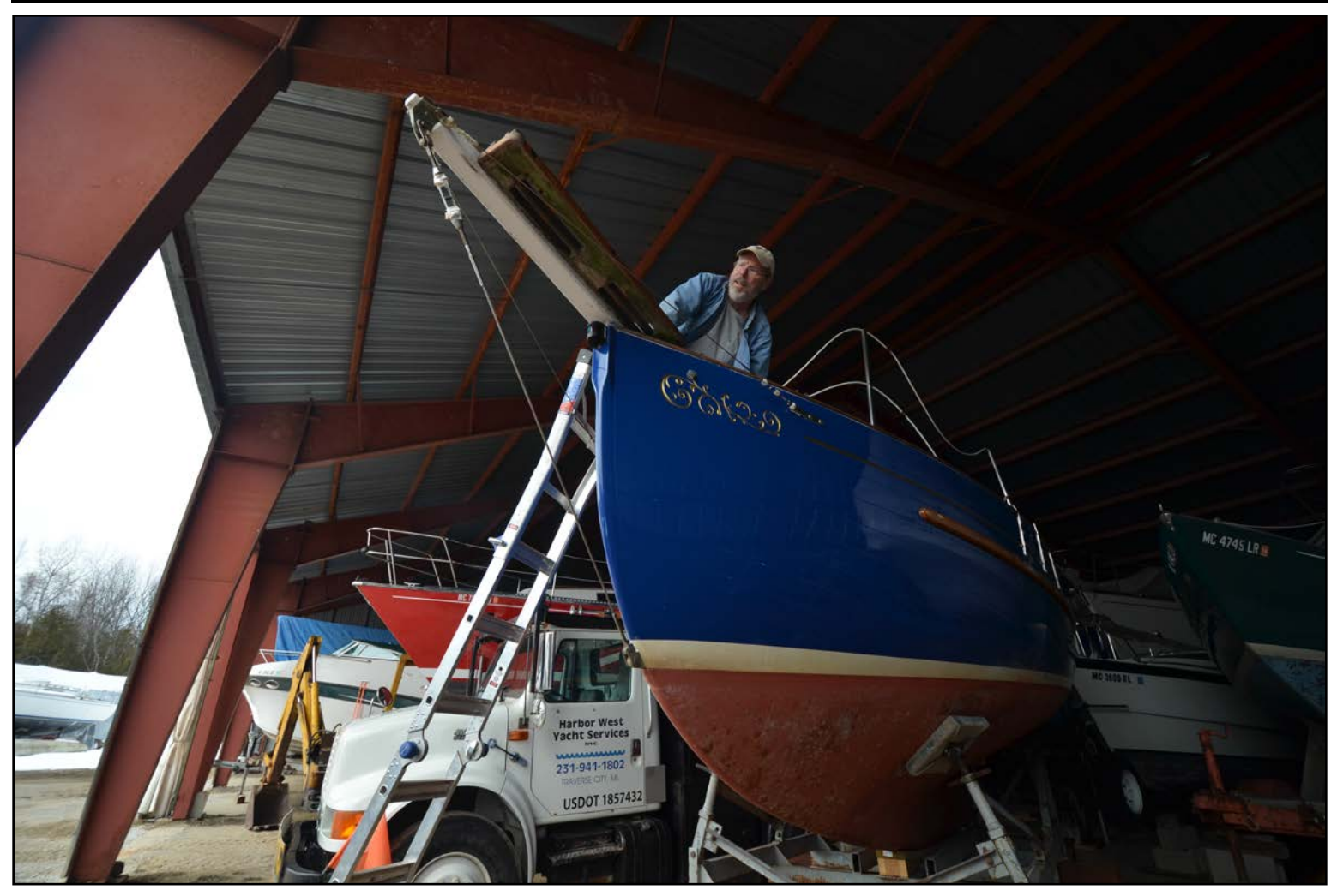
15. Michigan March bowsprit maintenance for s/y ZANZIBAR .