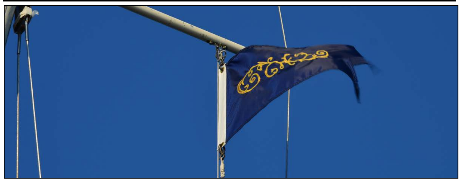
17. Flicka 20 Burgee flying on the starboard spreader of s/y ZANZIBAR on Grand Traverse Bay.