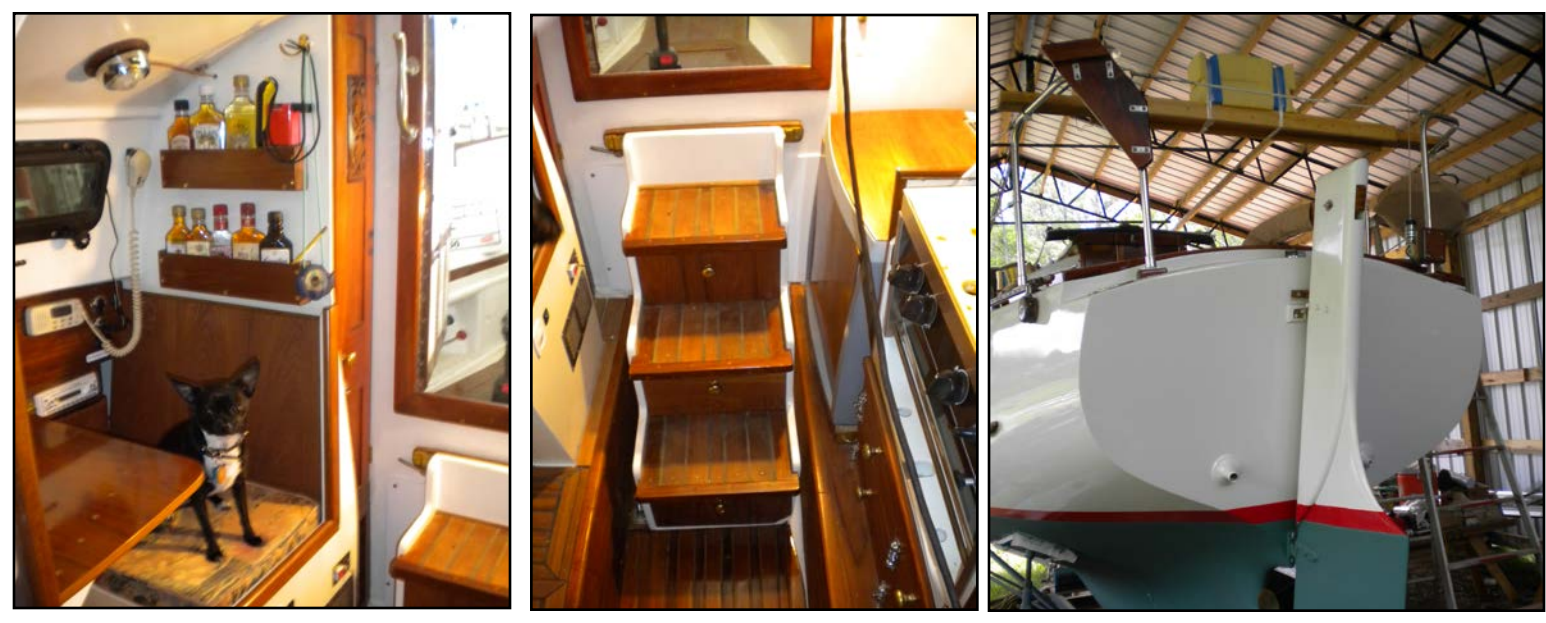
9-10-11. First Mate Harley at the navigation station guarding the liquor, steps with storage, and waiting for the mast.