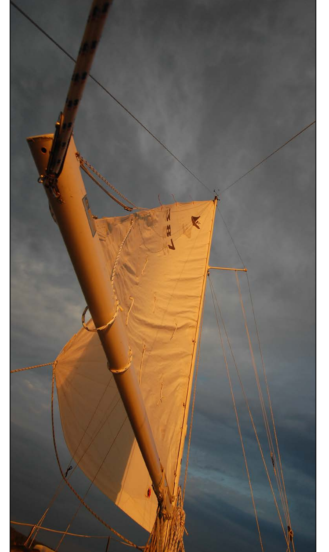
2. Sunset sailing on Grand Traverse Bay aboard s/y ZANZIBAR.