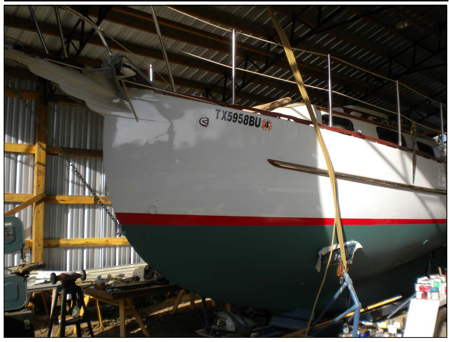
8. A labor of love...forty years old and never got wet. That will change for s/y ENTERPRISE very soon.