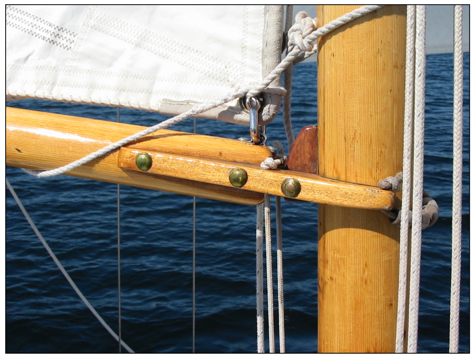
18. Boom and mast aboard the gaff rigged BEN MAIN, Jr., Pacific Seacraft Flicka # 315.