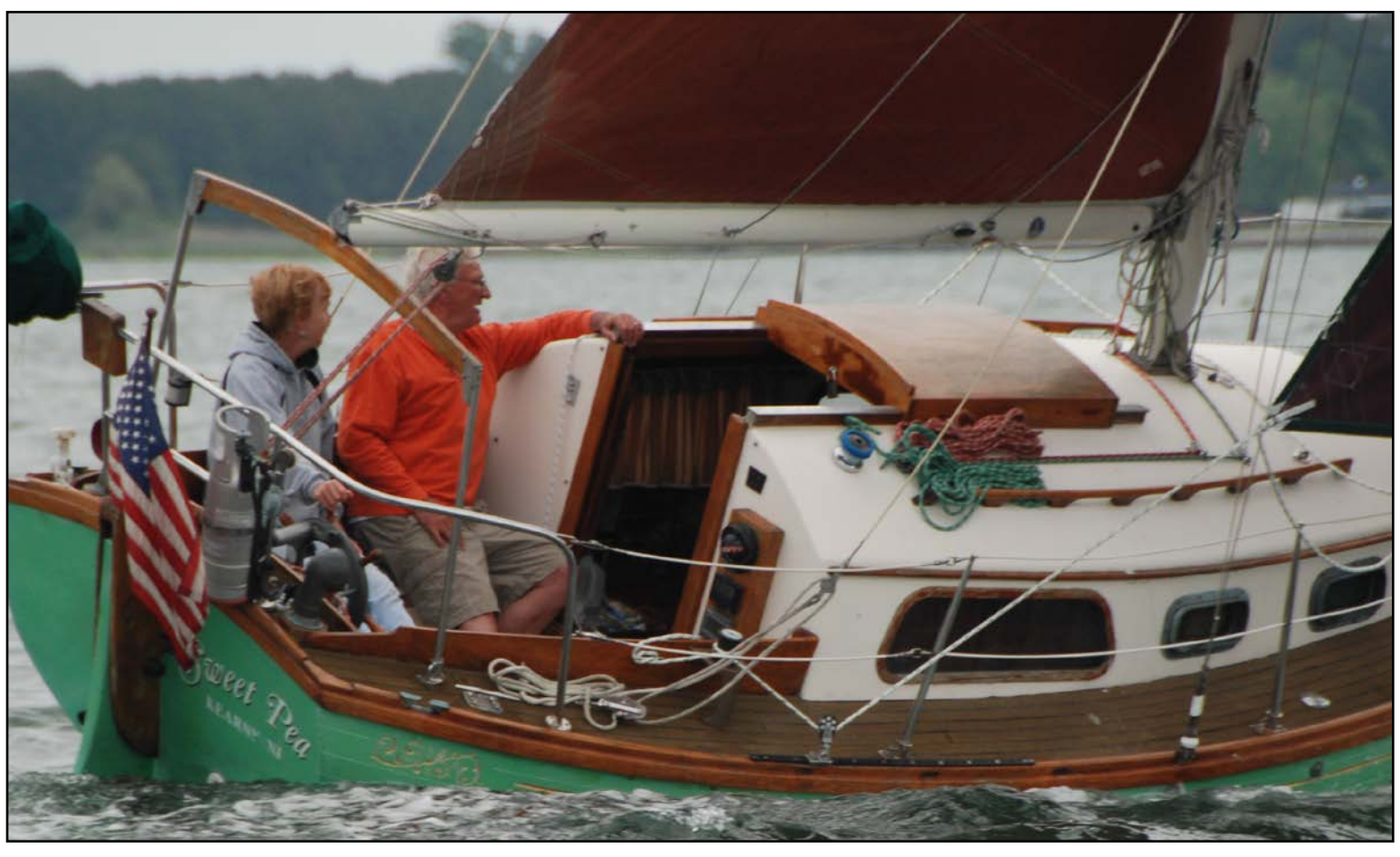
6. SWEET PEA on a glorious broad reach up the Choptank from the Chesapeake to Oxford and her home