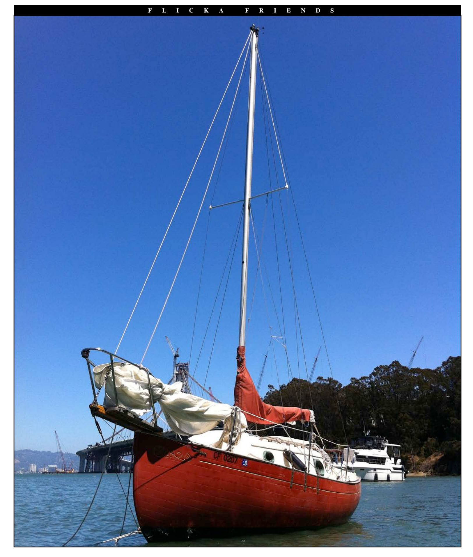
19. WHISPER moored in Clipper Cove on Treasure Island in San Francisco Bay.