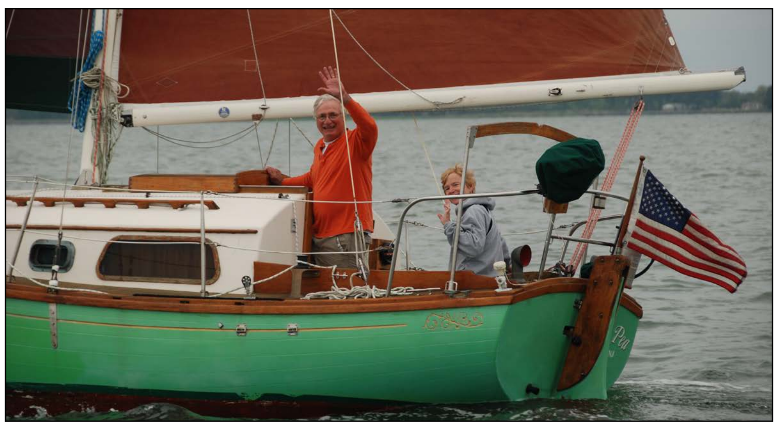
7. Fine Flicka sailing aboard s/y SWEET PEA on Chesapeake Bay.