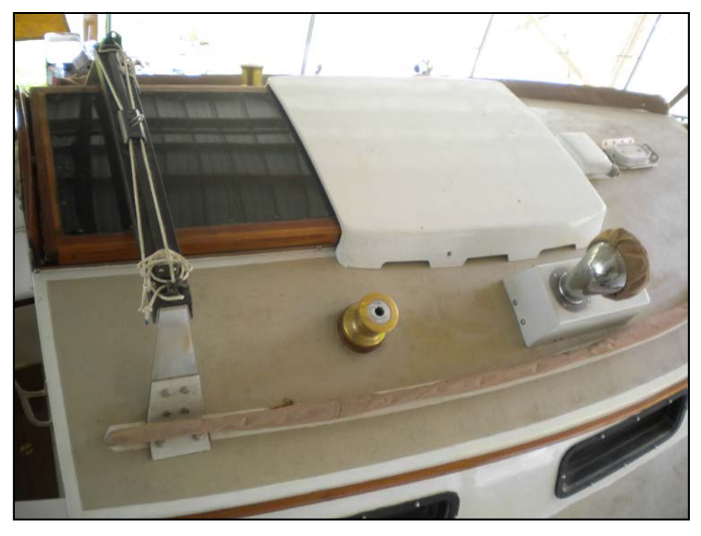
13. Midships main traveler.