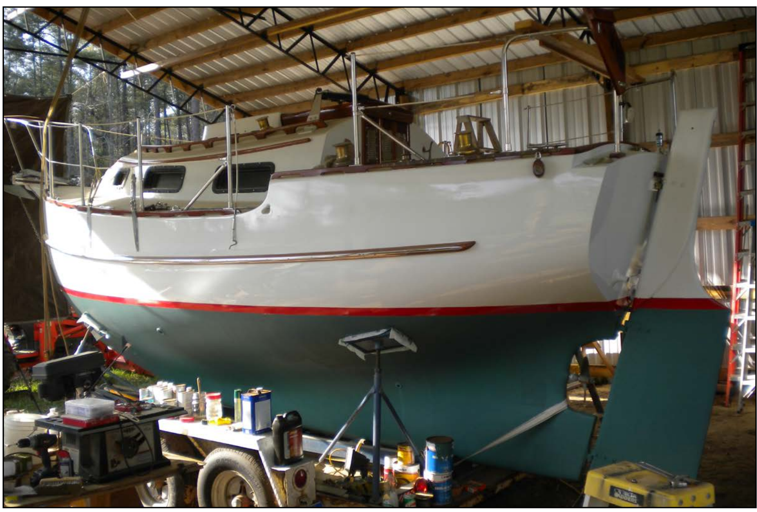
12. A mixture of teak and mahogany along with chrome, bronze and brass.