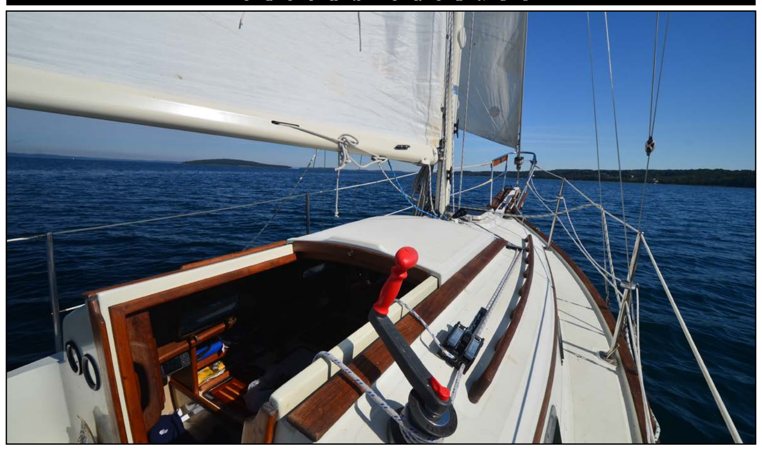
6. Heading toward Power Island aboard s/y ZANZIBAR .