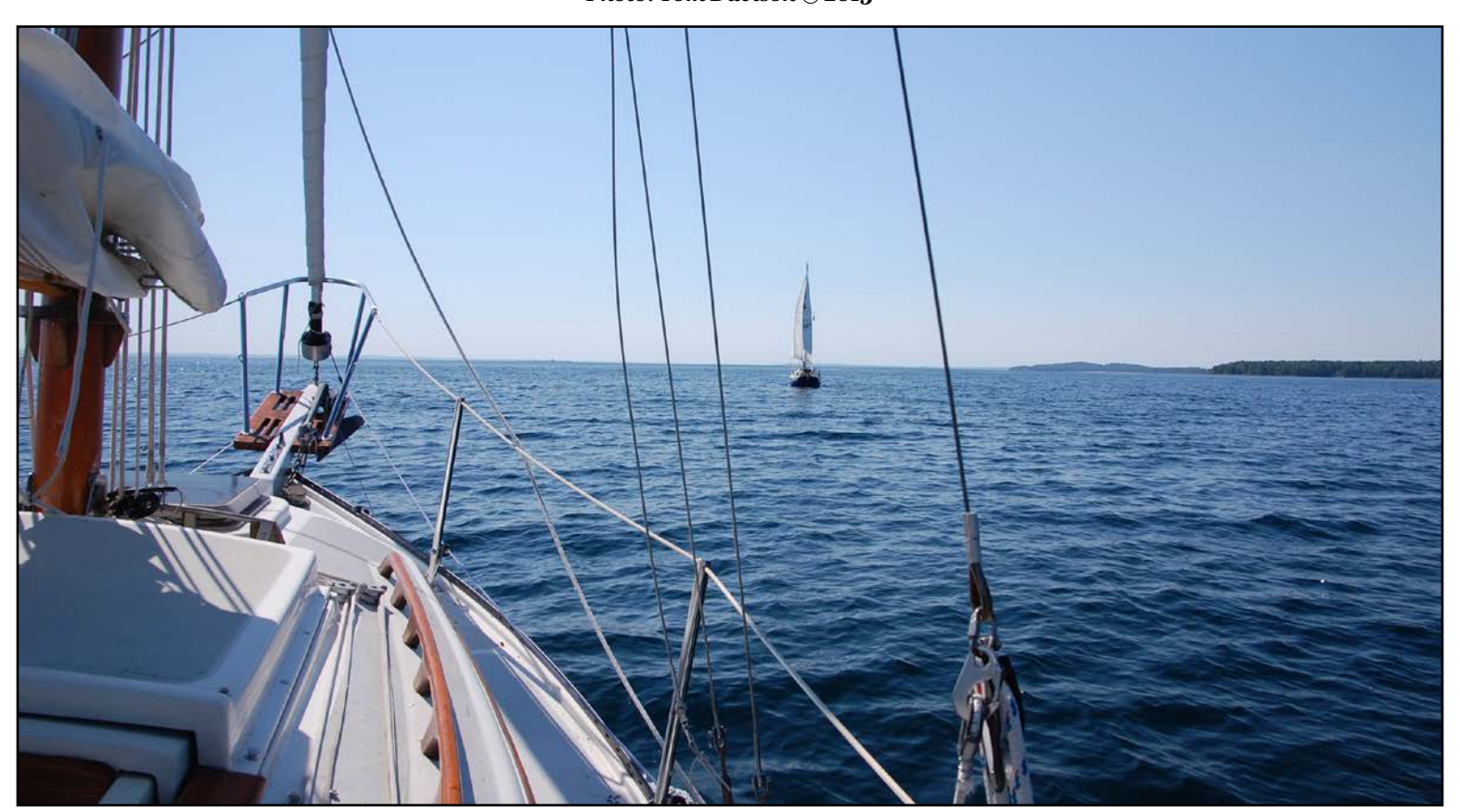
11. Chasing another Flicka: s/y BEN MAIN, Jr. following s/y ZANZIBAR.