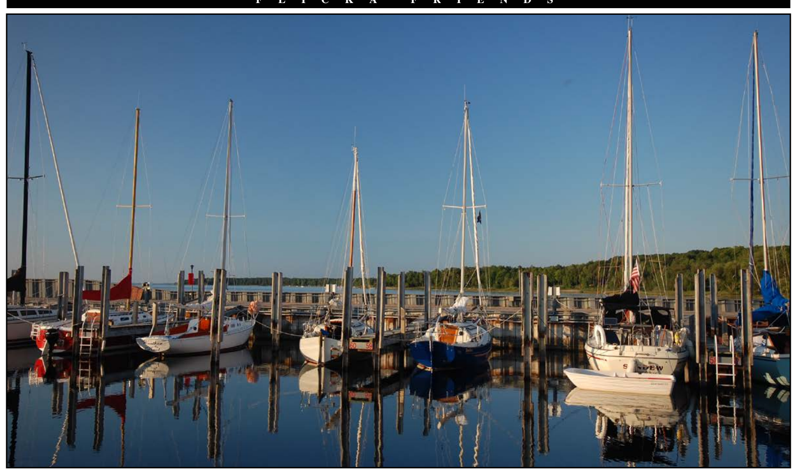
10. Two Flickas at the marina in Northport, Michigan: s/y BEN MAIN, Jr. and s/y ZANZIBAR.