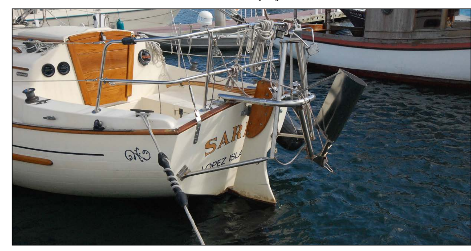
17. SARNIA at the Galley Dock on Lopez Island, Washington.