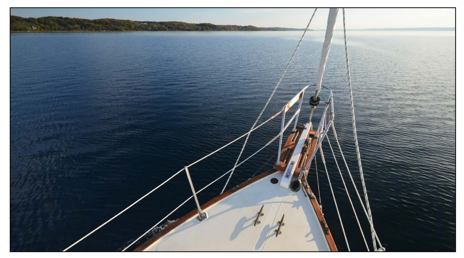
7. Southbound near Power Island on Flicka # 387, s/y ZANZIBAR .