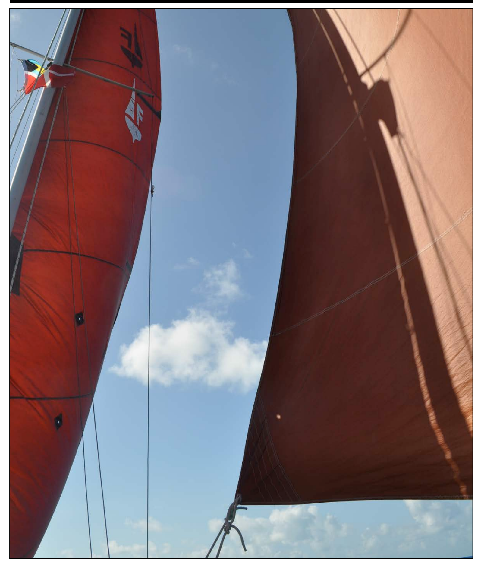
18. Tanbark sails and a Bahamas Courtesy Flag on s/y DAISY .