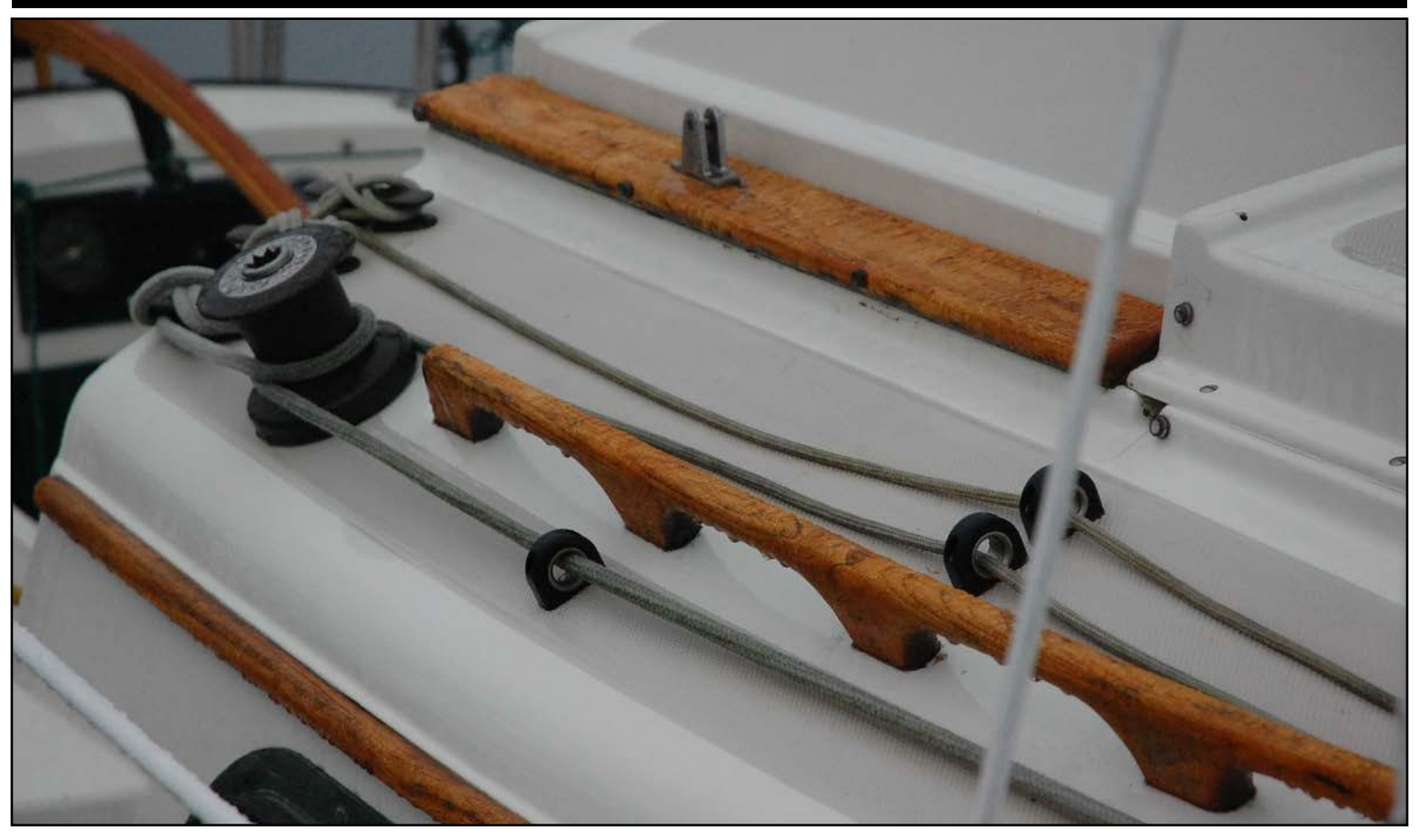
16. Another rainy day aboard s/y BLUE SKIES at Lopez Island, Washington.