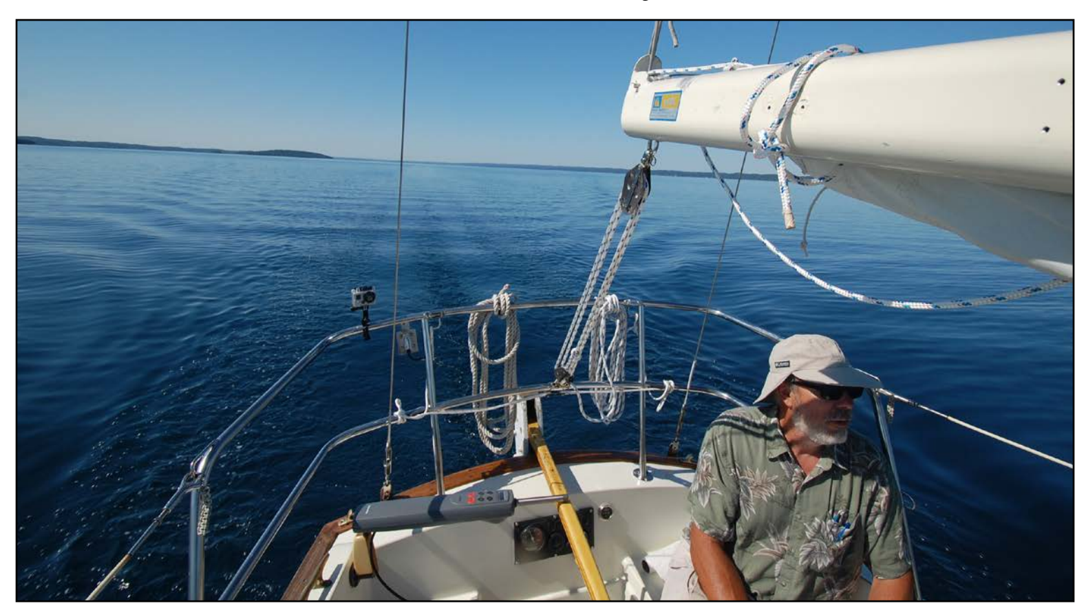
5. Motoring in calm conditions with the autopilot doing the work: s/y ZANZIBAR .