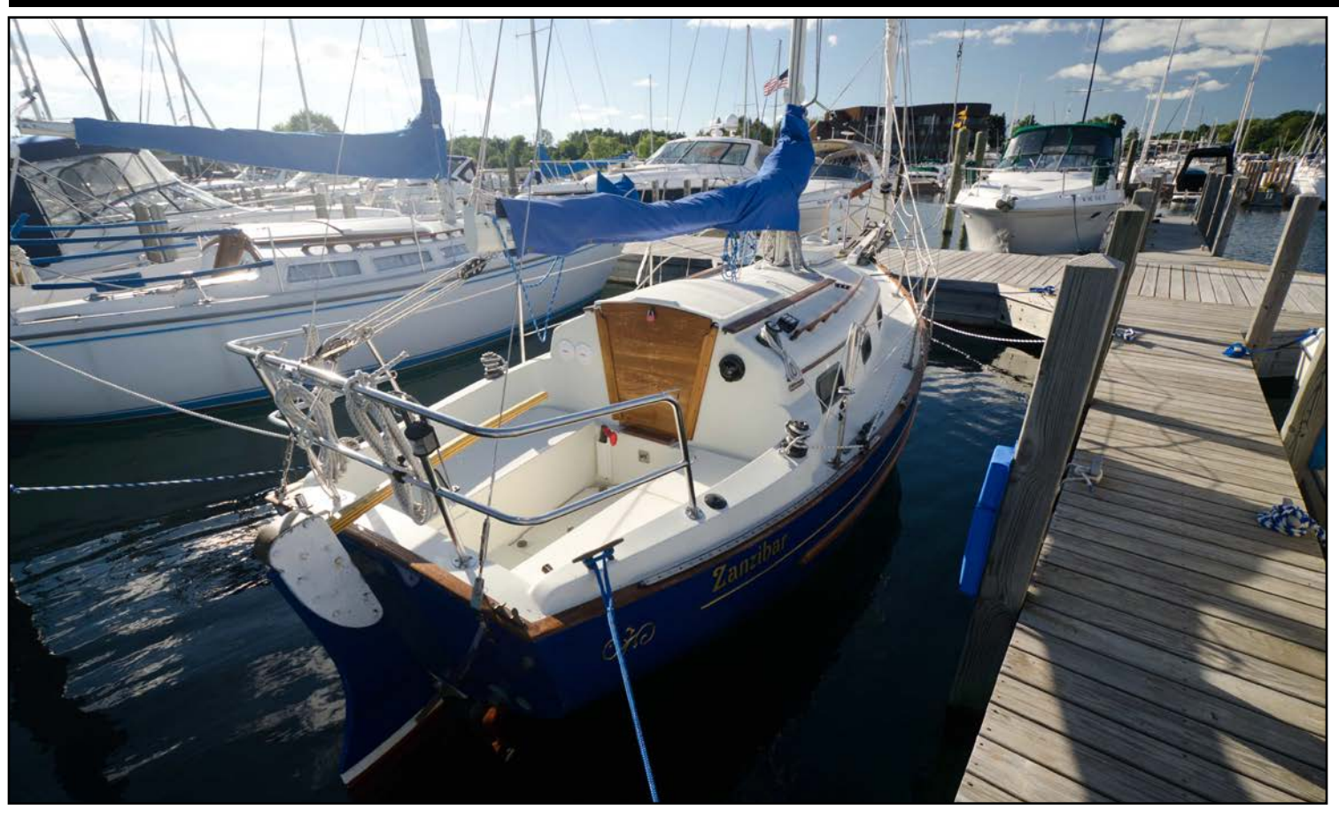
4. Wishing for summer on the Great Lakes, s/y ZANZIBAR is currently in winter storage.