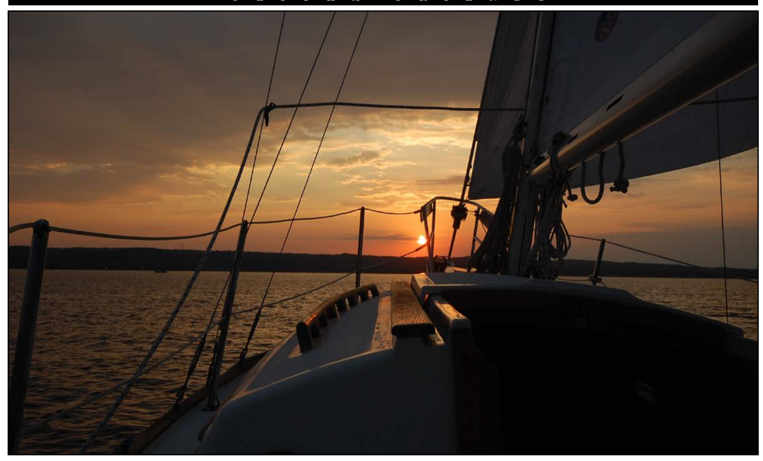
12. Sunset sailing on Grand Traverse Bay: s/y ZANZIBAR .