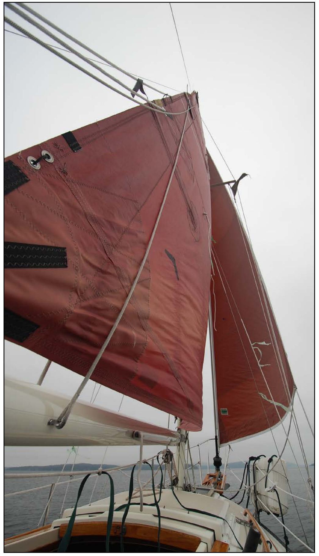
3. Sailing s/y BLUE SKIES near San Juan Island, Washington.