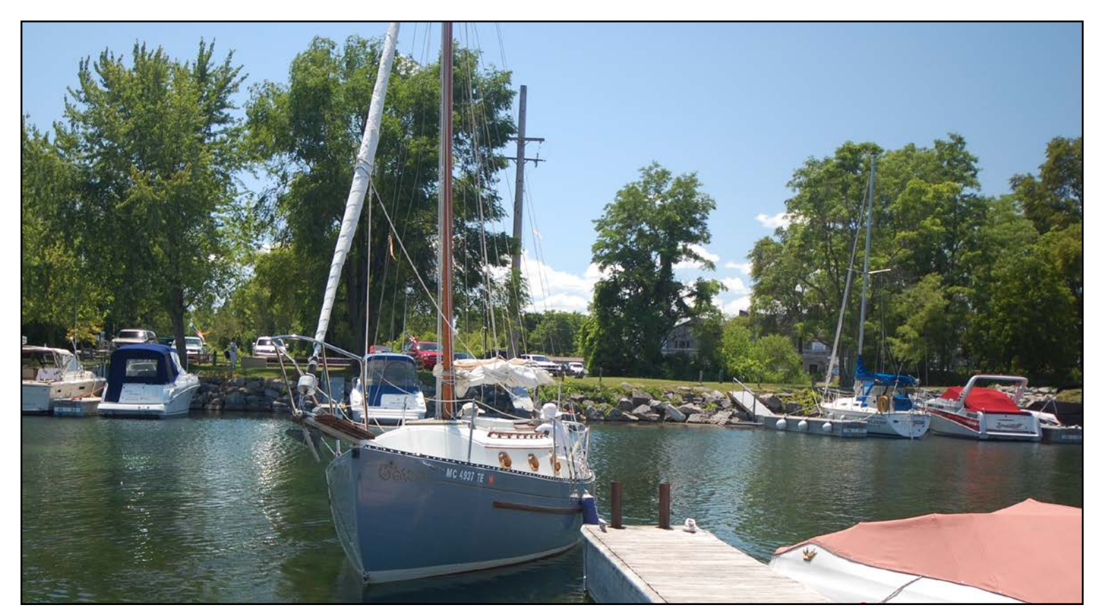
9. Backing out of the dock for an overnight trip to Northport, MI aboard s/y BEN MAIN , Jr. and s/y ZANZIBAR .