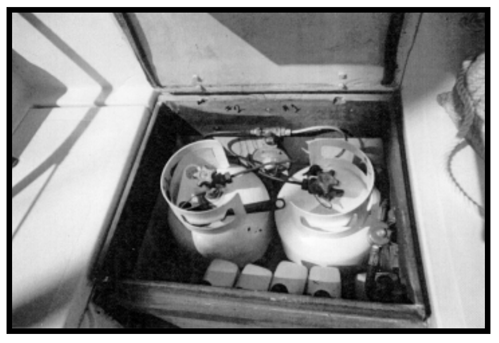
The propane storage box located in the aft cockpit of TAN BARQUE (Pacific Seacraft Flicka # 277)

A simple-two way vale connected either the #1 or #2 tank to the regulator, then on to the line to the solenoid that goes