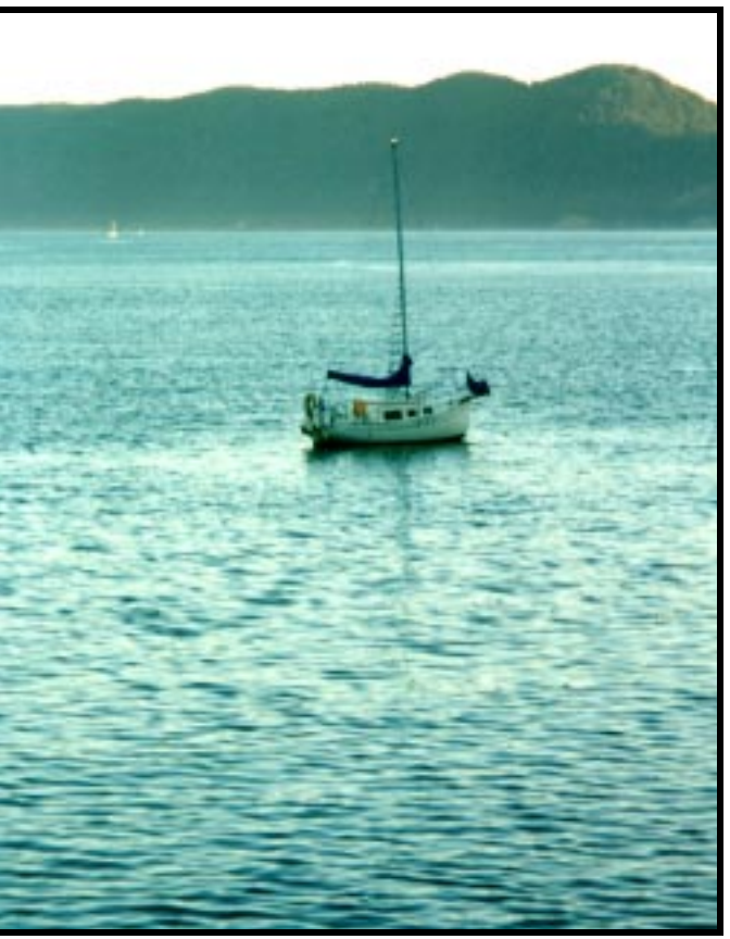
AMERICAN PIE anchored in Doe Bay on Orcas Island.

It felt almost decadent to be cruising on a Monday while everyone else was working. We made the short trip from Lopez to the Port of Friday Harbor Marina in a couple hours and berthed along the guest dock, which is about a 5 mile walk from the