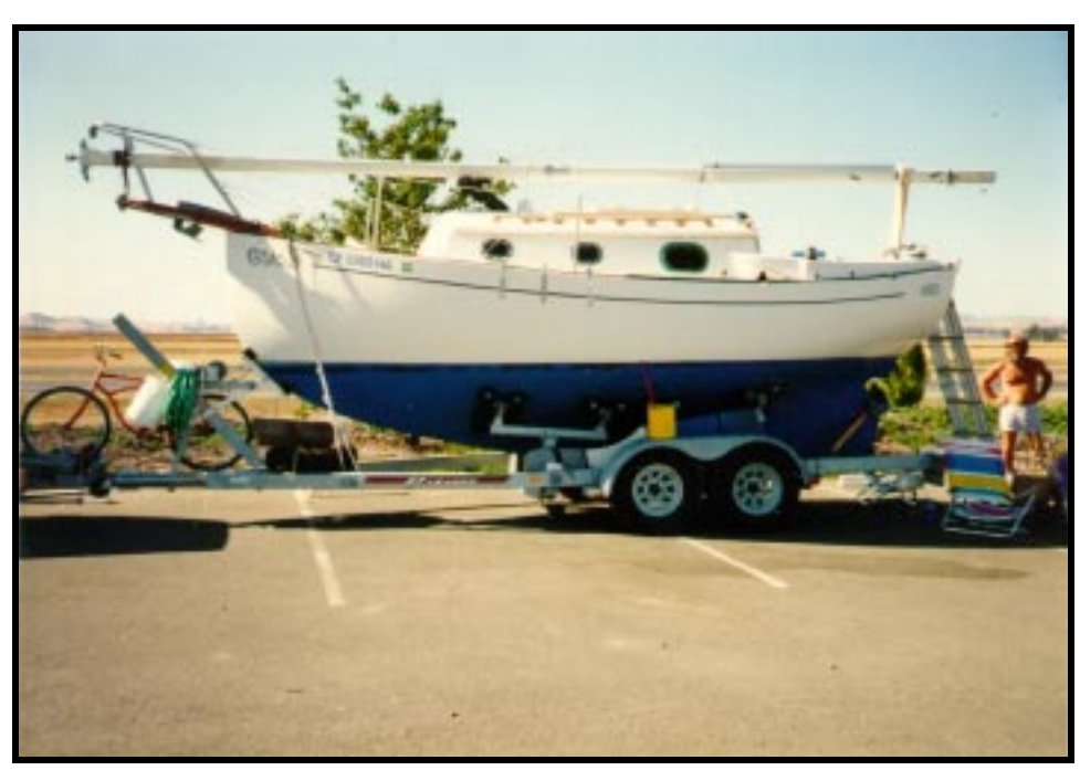
CORSAIR (Flicka # 199) ready for another freeway passage