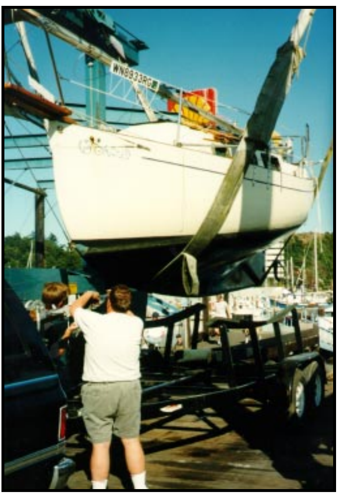
AMERICAN PIE being placed on the trailer in Anacortes, WA at the end of the weekend.

We had a clear view of our destination at Cap Sante until the fog blew back in. With low visibility we heard the fog horn of a fast moving ferry off our starboard bow and made a quick dodge to port. The silhouette of the ferry passed us at 100 yards or so and the fog quickly lifted. Going through Guemes Channel at the end of a weekend is a carnival ride as dozens of powerful wake monsters head in