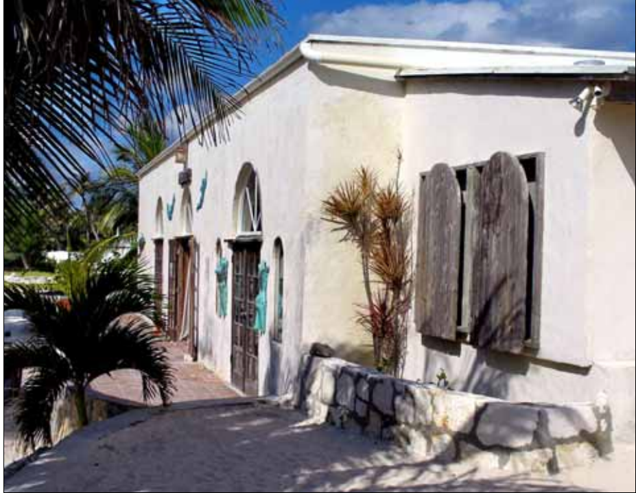
Next to Pete's bar is his late father's art gallery.

Little Harbour is a small anchorage that is pretty well at the bottom of the Abaco chain. It is used as a jumping off point to cross south to Eluethra or the Exumas. The harbour itself is small and houses a art gallery owned by Pete of "Pete's Pub" fame. The little open-air bar/restaurant is famous but Pete's Dad was a world class sculptor working with bronze. Pete himself is also a very gifted artist. A gallery holding sculptures by Pete, his late father, as well as art created by other locals, is offered for sale.