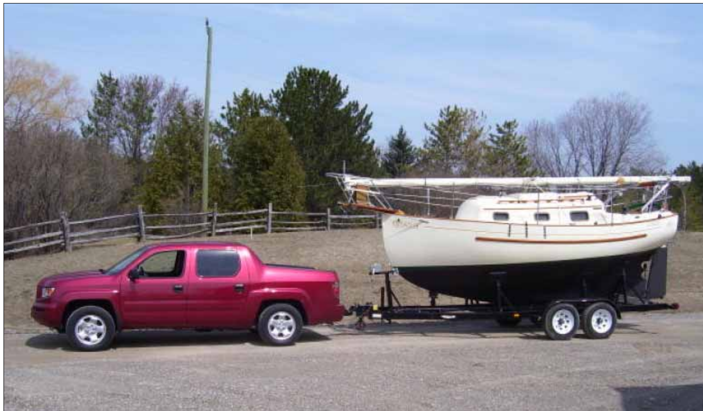
My new Flicka, s/y JUBILEE is ready to be towed home for the first time.