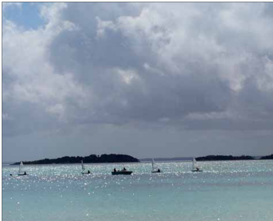
The junior sailors racing their optimists at Hope Town.