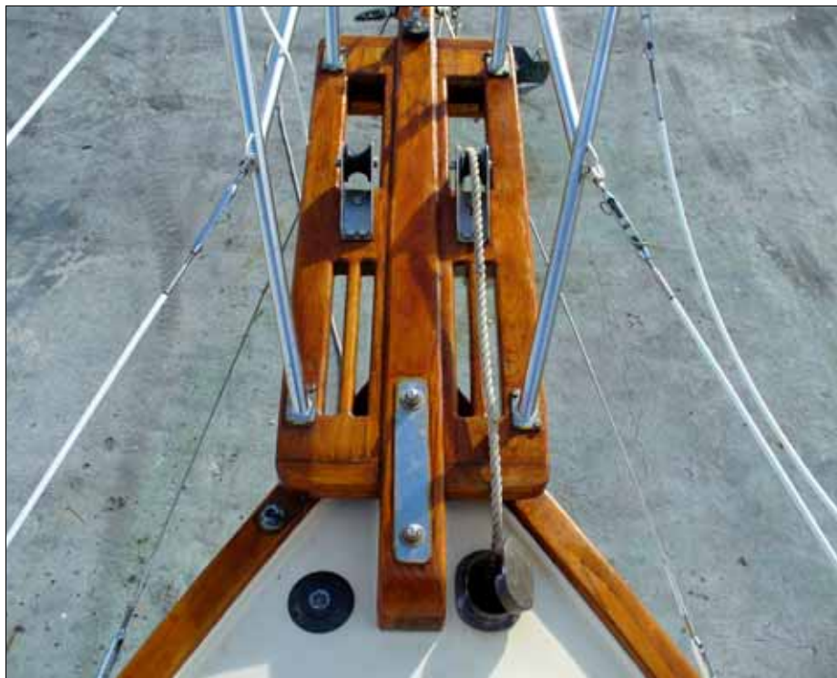
The bowsprit with a new coat of Cetol.