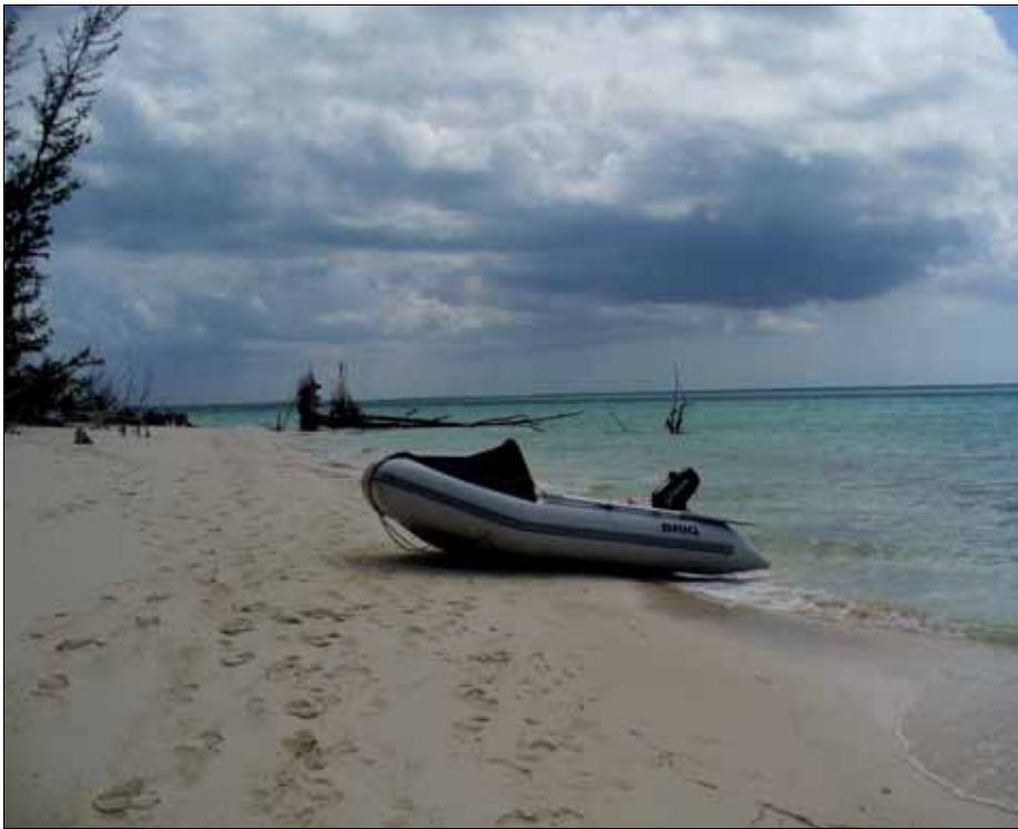
Exploring Manjack with the new dinghy and engine.

palms from the veranda, looking out at the boats anchored, gives one a “I’m in paradise” feeling.