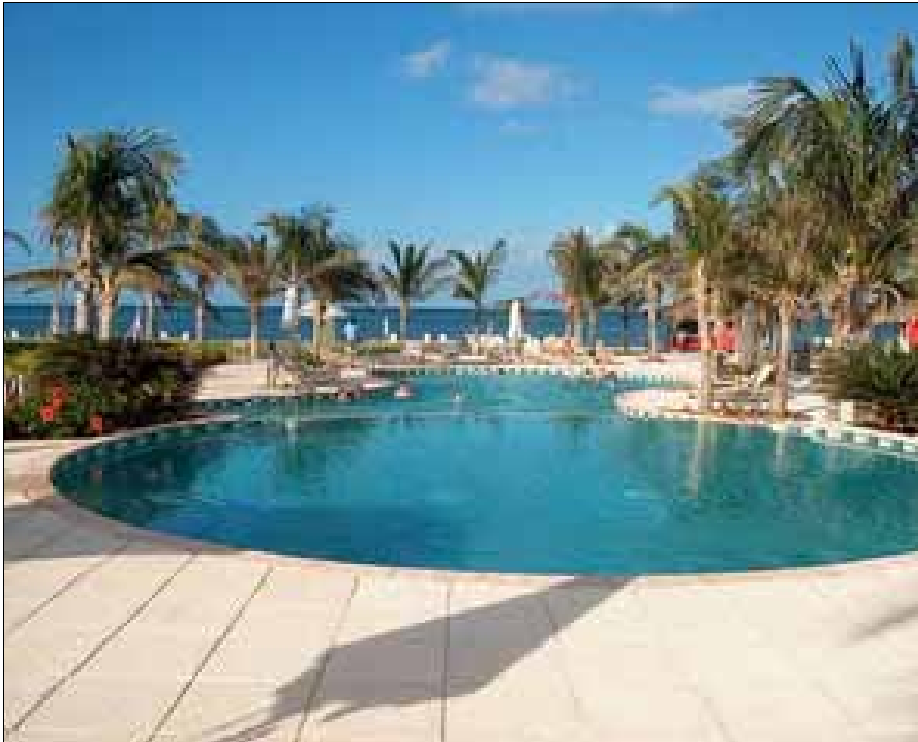
The use of the hotel swimming pool was included as well.