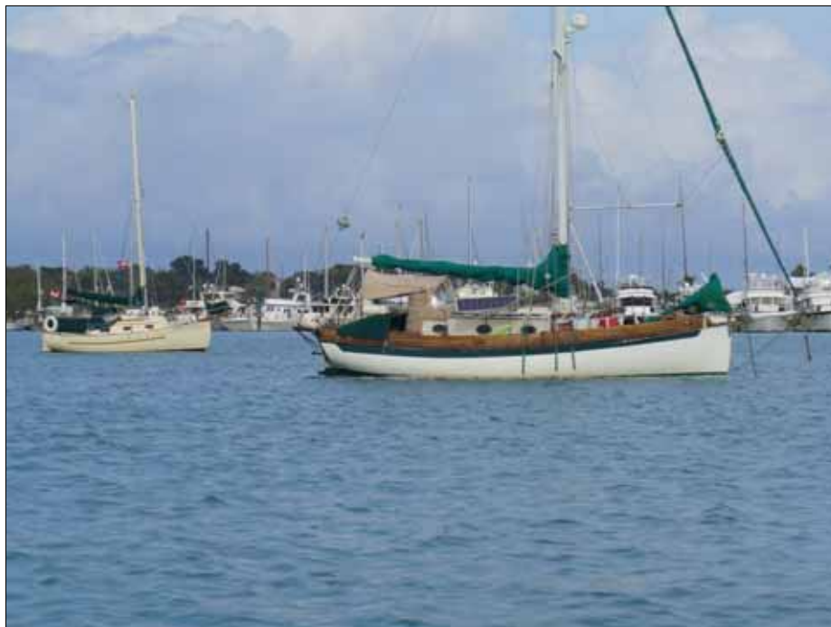
POLARUS JACK and JUBILEE in Marsh Harbor.

While there is a dogleg enroute, if you have shallow draft you can take a short-cut across a sandy bank to save time. Again, the Flicka proved to be a great Bahamas cruiser as we crossed the four foot bank without incident.