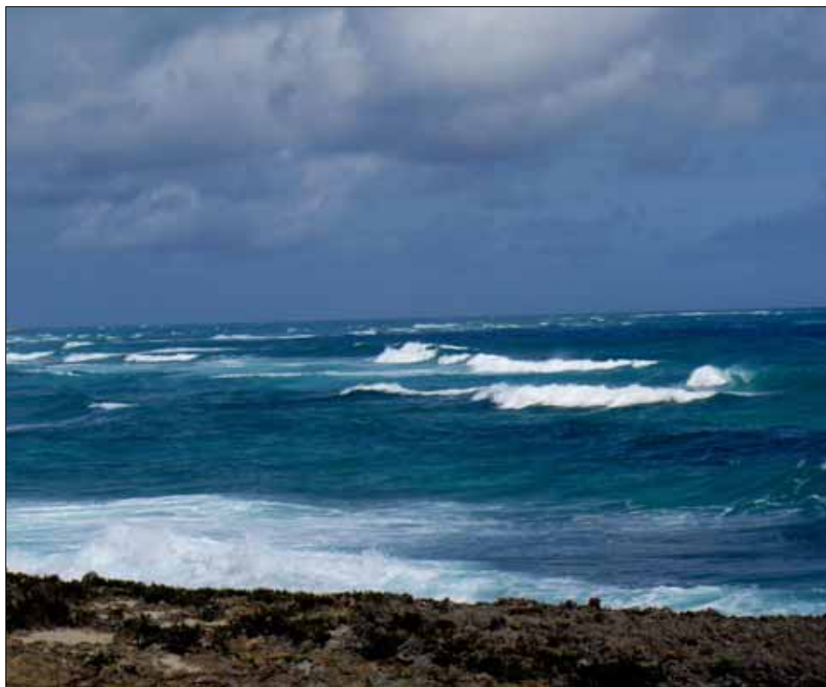
This is what the locals call a "Rage Sea."