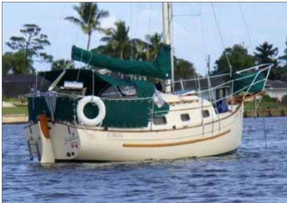
JUBILEE anchored in Stuart, Florida.

The injector rebuild guys were great as well and got both pieces done in less than twenty-four hours at a fair price. Back at the boat, I put humpty-dumpty back together again and surprise.....IT RAN! Felt great doing it myself.