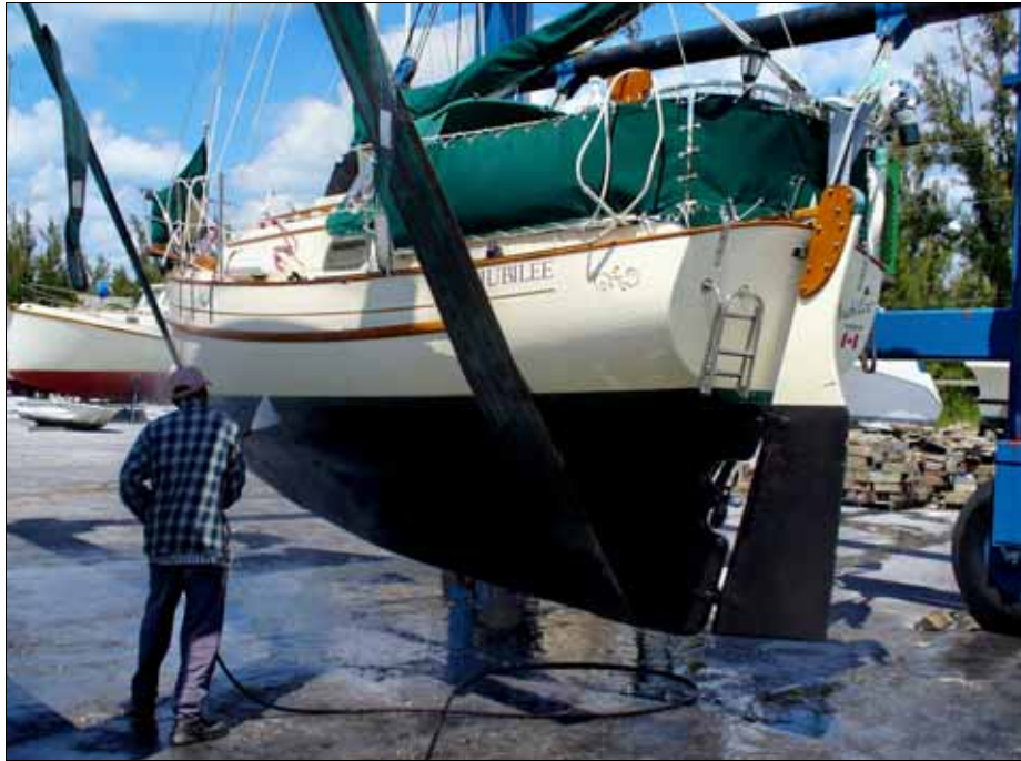
Preparing s/y JUBILEE for storage.