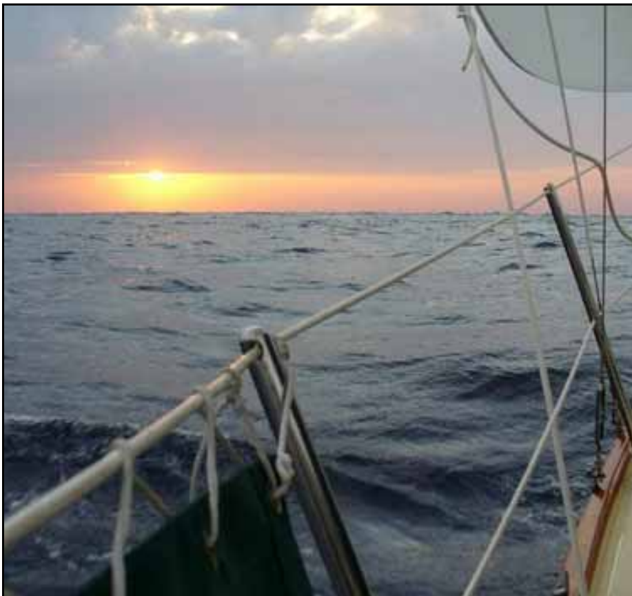
Atlantic sunrise over the port side on the way to the Bahamas.