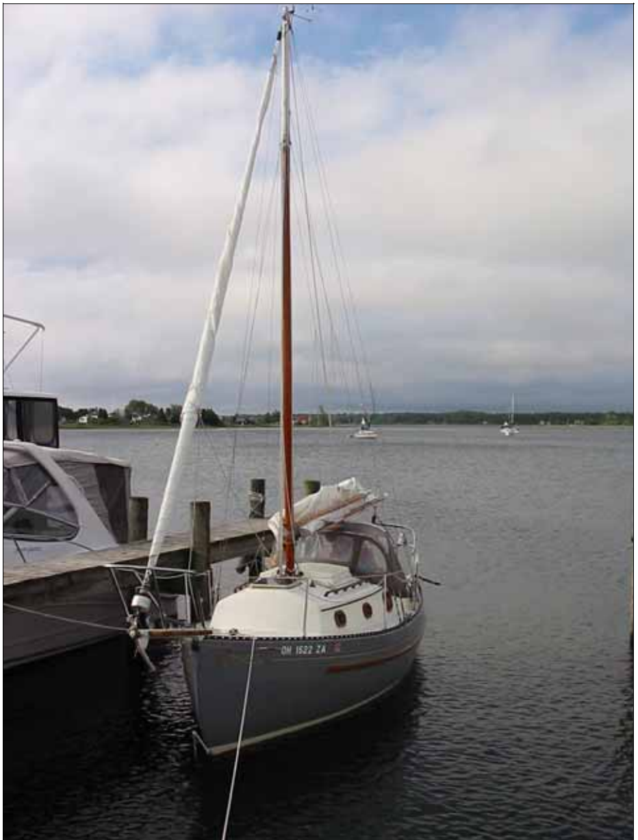
BEN MAIN, Jr. docked at the Beaver Island Marina.