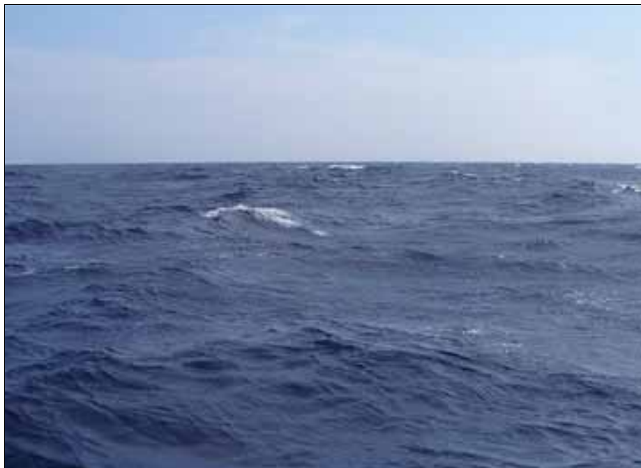
The conditions on the Gulf Stream crossing before it got bad.

Being at the marina at West End gives you full resort use including the nice beach and a swimming pool. Old Bahama Bay resort is an easy place to hang out in with both a formal and casual restaurant, bar, pools, exercise