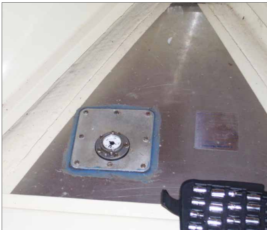
Fuel Tank access aboard s/y JUBILEE