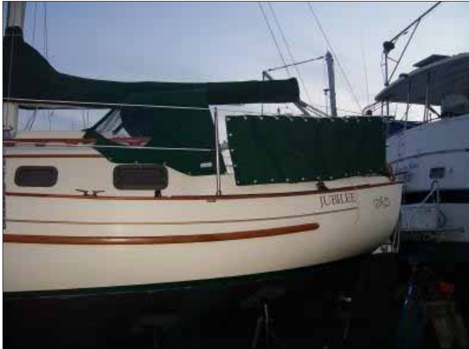
A new dodger, weather cloths, and sail cover were installed.