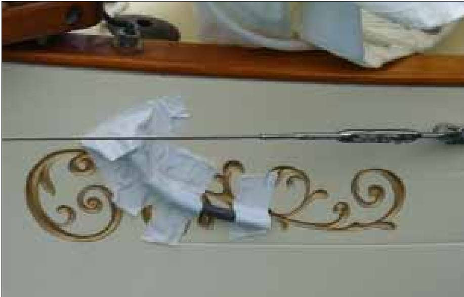
This ugly system kept water out of the diesel fuel tank.