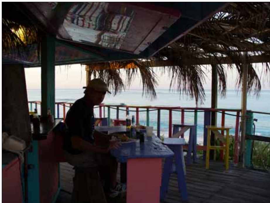
The view from Nippers Bar.

A great evening was spent with two other couples in the cockpit of a beautifully finished Morgan 38. Sometimes age and wisdom pay off. Not only did I