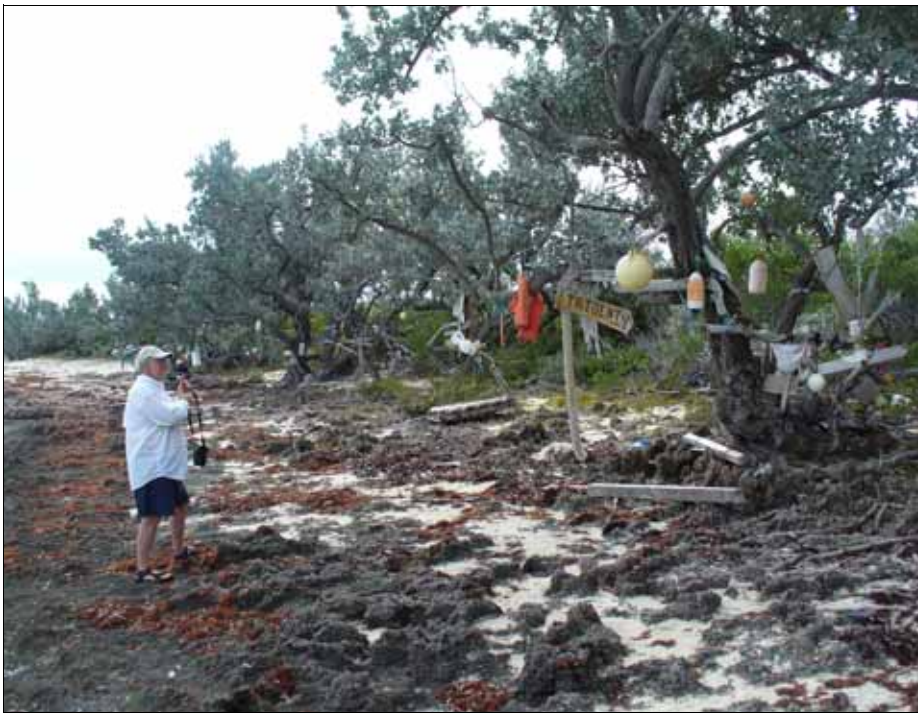
Doug examining Allen/Pensacola's famous "signing trees."