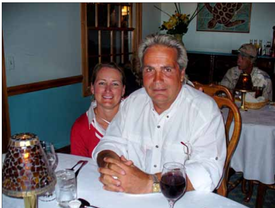
Enjoying my fiftieth birthday at the Green Turtle Club.