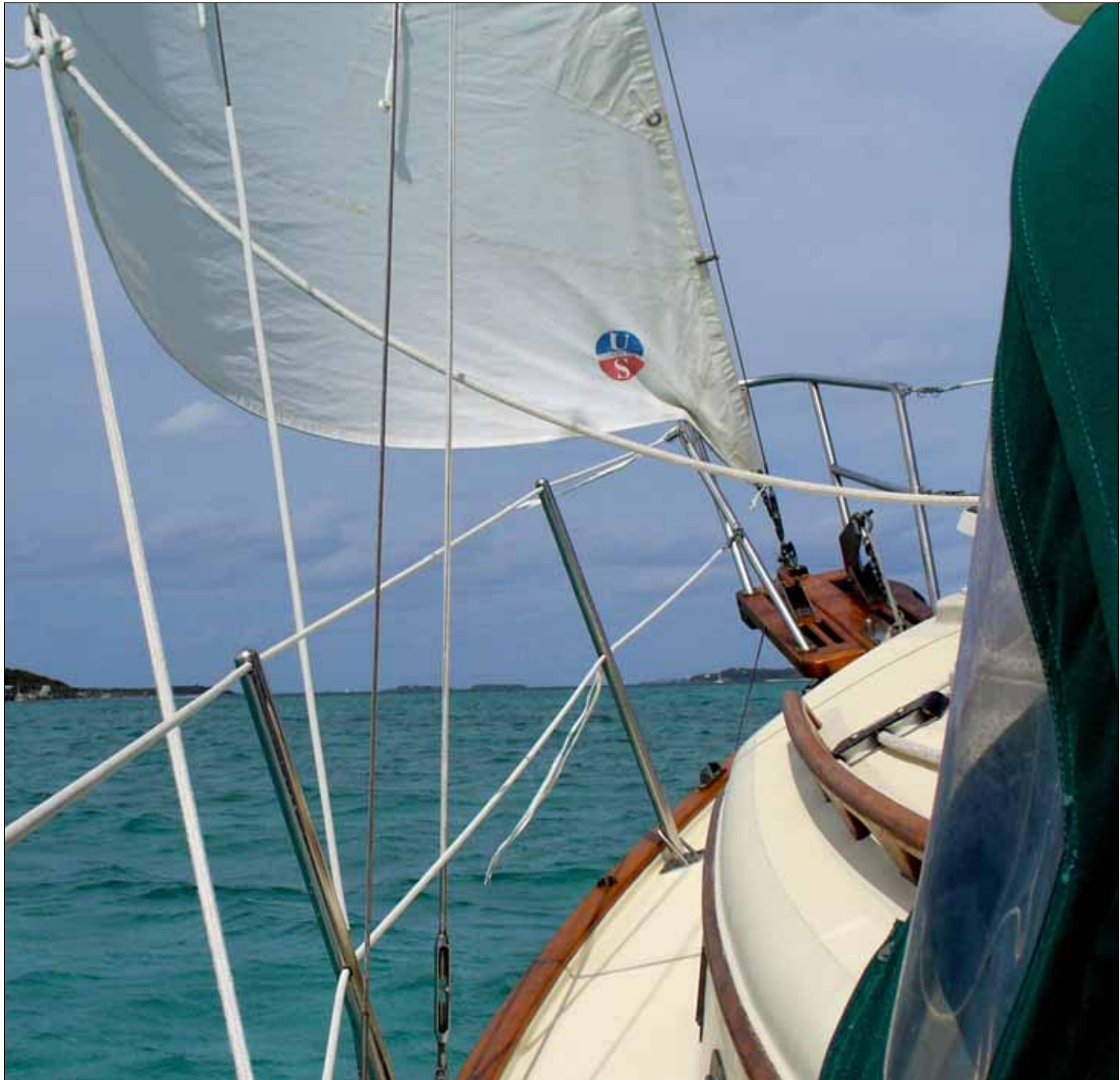
Sailing down to Little Harbor aboard s/y JUBILEE.