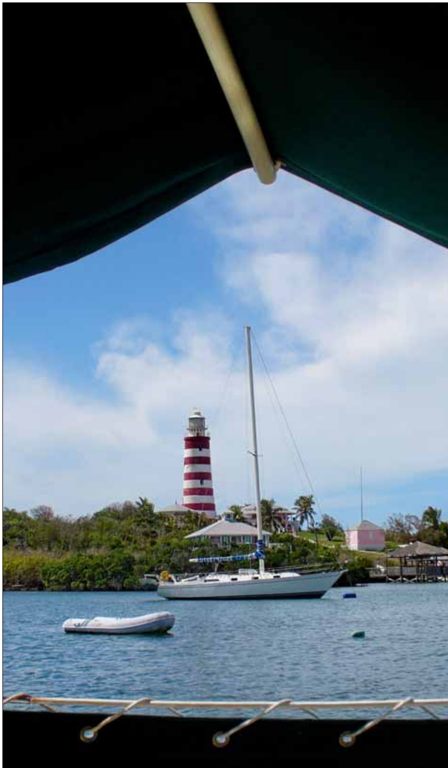
The view of Hope Town from s/v JUBILEE.