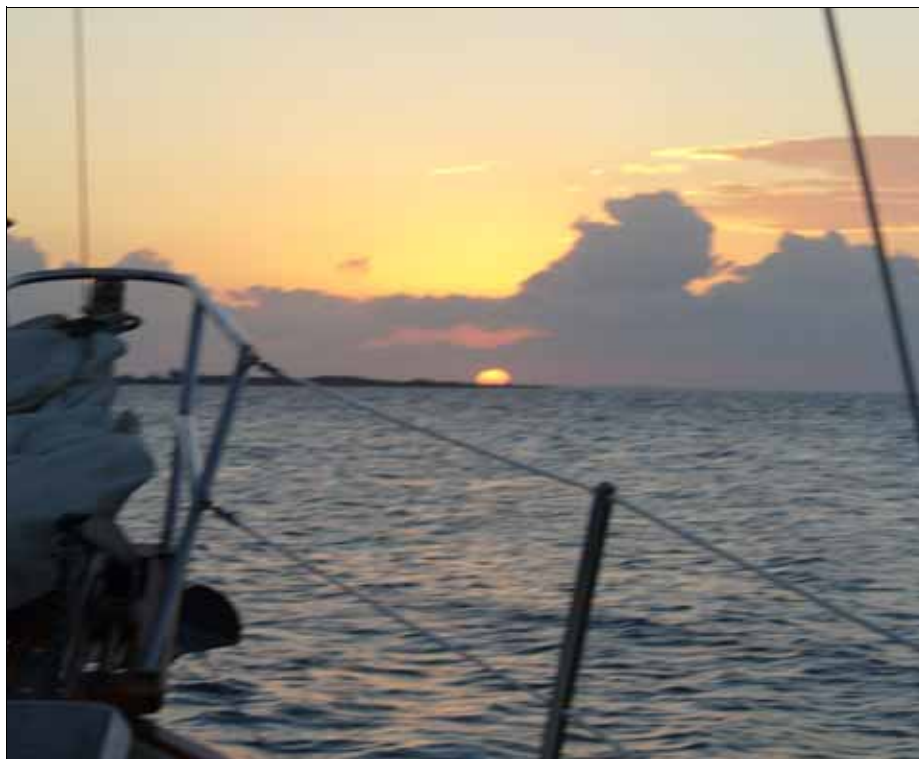
An early morning departure from Allen/Pensacola Cay.