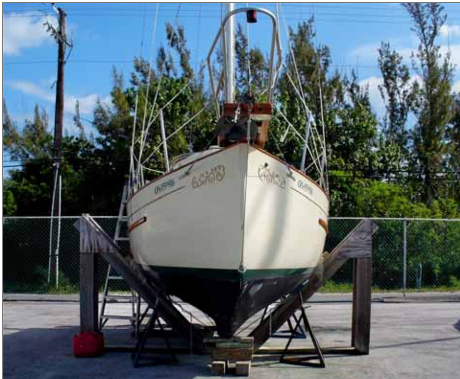
JUBILEE is stored with stands and wooden supports.

Funny, it was only the last few weeks of my ten week plus cruise that I truly mastered the head and could both enter and exit with my shorts up. Anyone with an enclosed head Flicka knows what I mean. Maybe it was the twenty pounds that I lost walking and swimming.