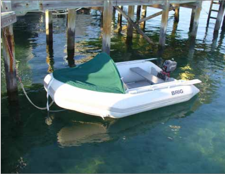
My dodger for the new dinghy.