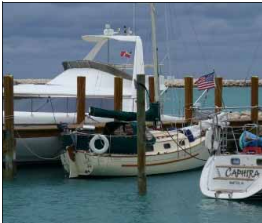
JUBILEE at the West End, Grand Bahama Island.