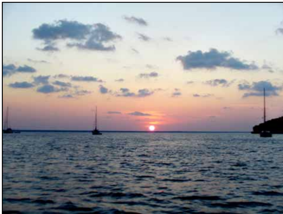
Sunset from Manjack Cay.

Later, we found out that winds were twenty-five to thirty knots with gusts way higher. It was nice to see ManJack come into view as it has always been a favorite island. There are three nice bays on the Sea of Abaco side, a pretty lagoon on the northwest end, and a mile long beach on the ocean reef side. Great diving is had all around with two wrecks on one bay and many reefs, some very close and shallow enough to be easily snorkeled.