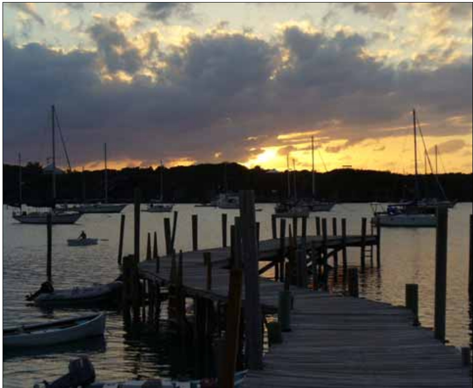
JUBILEE off the Crooked Dock in Little Harbor

enjoy the company but was granted a calm passage all the way to Guanna Cay the following day.