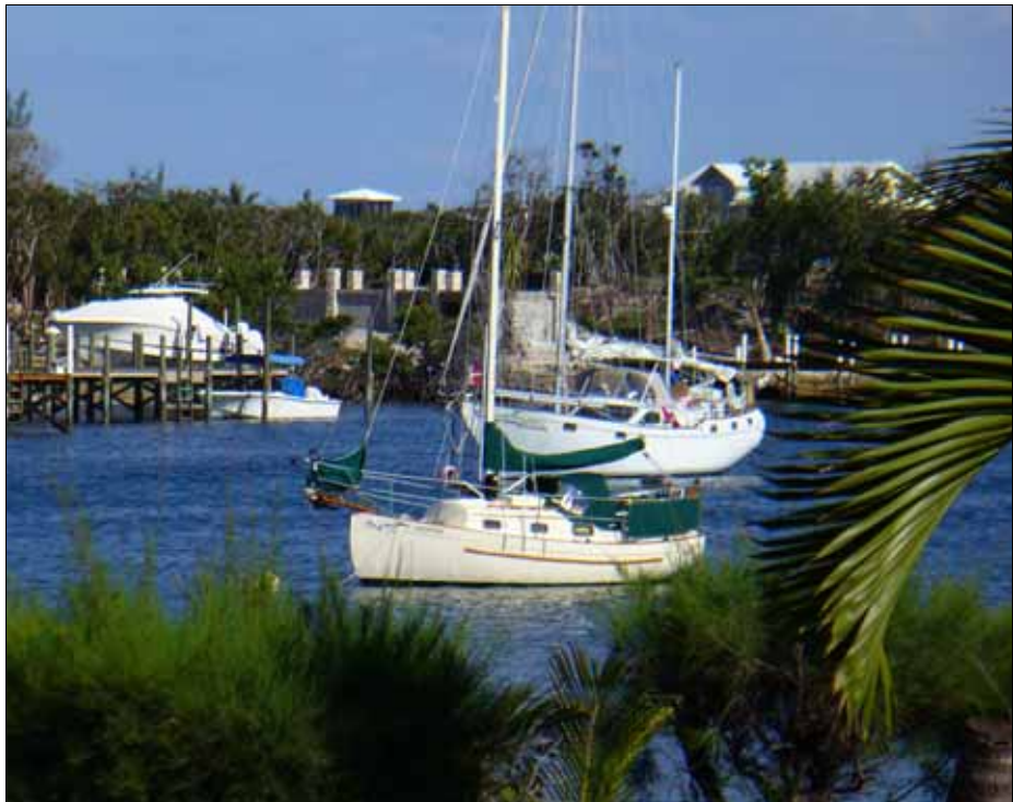
JUBILEE moored in Black Sound, Green Turtle Cay

A Florida couple, Bill and Leslie, settled here in 1992 and built a home. Since then, they have continued to improve their piece of paradise with gardens and fruit trees that has resulted in a park like setting. The view from their veranda is the big bay where most cruisers anchor. The atmosphere is wonderful as you compare notes and finds with others on the beaches. Knowing I would be back, it was off to show Doug Green Turtle Cay.