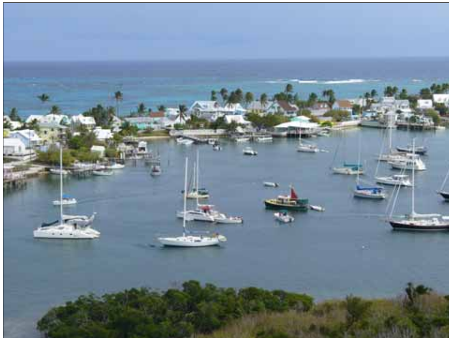
View from the Hope Town Lighthouse.

At Bill and Leslie's "estate" the plants are multi-colored and peep through the